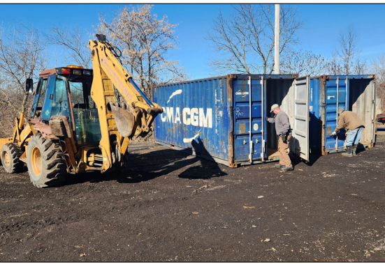
ABOVE: Four 20-foot containers were landed in the Construction Yard on February 20. This is part of our effort to consolidate our long-term storage and eliminate the trailers.