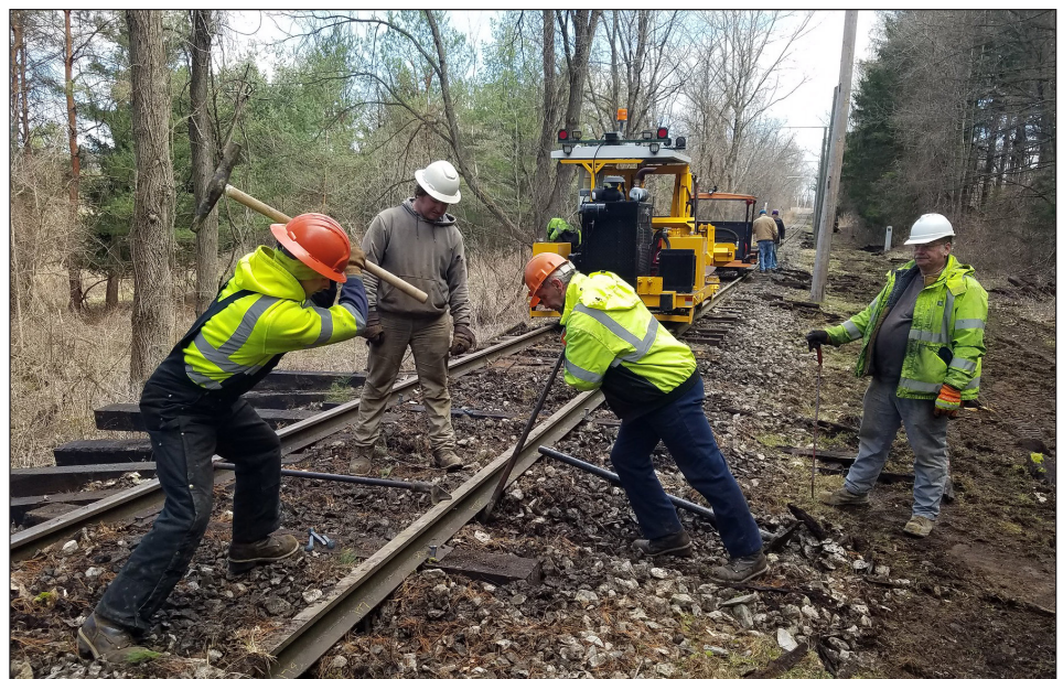
Contractors hard at work inserting ties into the museum railroad in 2022 as part of a joint track improvement project with New York Museum of Transportation.

The Passenger and Freight Rail Assistance Program (PFRAP) is administered by the New York State Department of Transportation and supports investments that enhance the safe movement of trains, improve service reliability, and supports economic development, especially upstate. Winning projects were selected through a competitive solicitation process and rated based on established criteria that include a benefit cost analysis, adherence to regional economic development plans, safety enhancements, compatibility with other private and public investments, and actions that enhance resilience and reduce climate risk. The funding, the largest amount ever awarded as part of PFRAP, will support 38 projects in every region of the state and will include track