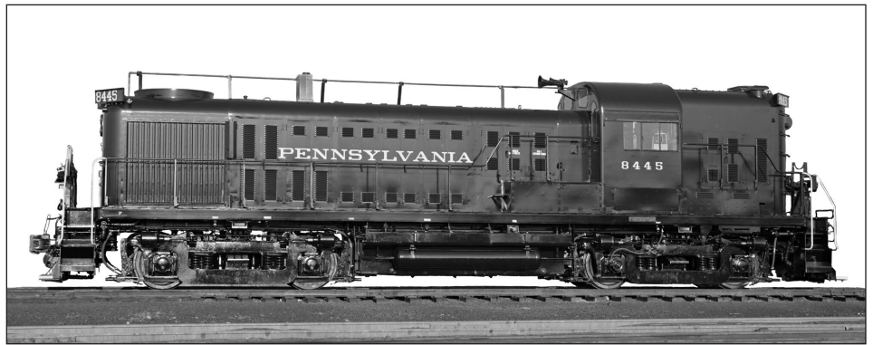
Builder's photo of Pennsylvania Railroad Alco RS-2 8445, one of five similar units built with a high short hood to accommodate both dynamic brakes and a steam generator for passenger service. Built in 1953, it was renumbered 5569 after the 1968 Penn Central merger. It was traded to Lehigh Valley in 1970 where it became 211. It was rebuilt by Conrail in 1979 and became 9900. Retired in 1981, it was acquired by several museum members and donated in 1986. It was restored to LV colors in 1990 and remains an important part of our museum's operating fleet.

©2024 Rochester & Genesee Valley Railroad Museum. The Semaphore is published monthly by the Rochester & Genesee Valley Railroad Museum. Electronic distribution by e-mail is free. First-Class mailing is available for $20.00 a year. Non-member mailed subscriptions are $25.00 and run from January 1 to Dec. 31. Member meetings are held the third Thursday of each month, and the Board of Trustees meets the first Thursday of each month. Any items related to the activities of the Rochester & Genesee Valley Railroad Museum, and regional railroad history and current events are gladly accepted for publication.