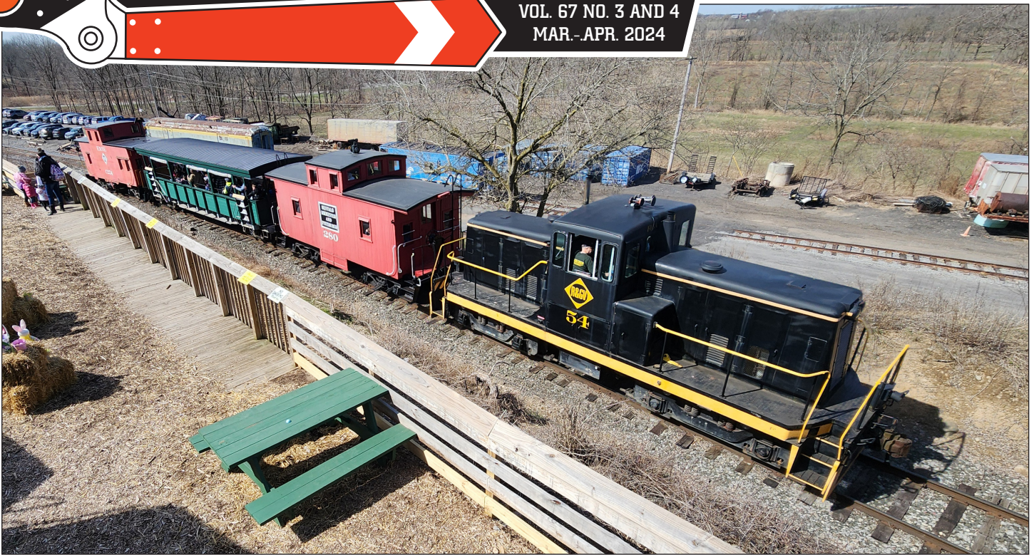
Our excursion train makes its way past the Railfan Overlook during Easter Bunny Train Rides on March 30.