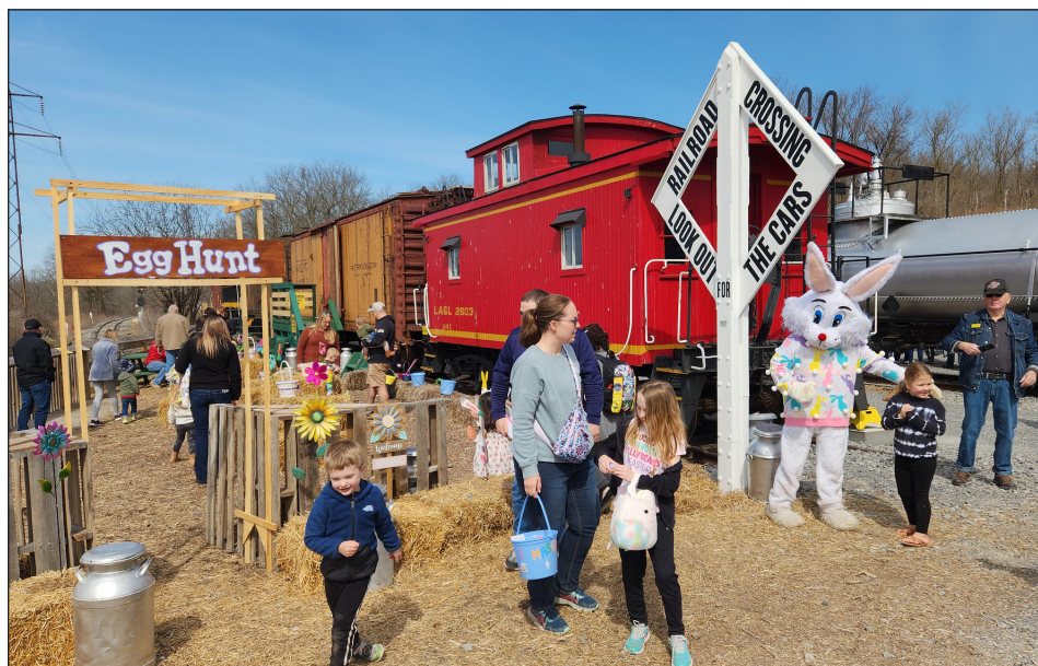
LEFT: We had sunny, but chilly weather for our sold-out Easter Bunny Train Rides on March 30! Visitors loved the expanded egg hunt area in the Upper Yard!

NOTICE: July 4 Trustees Meeting has been rescheduled to July 11.