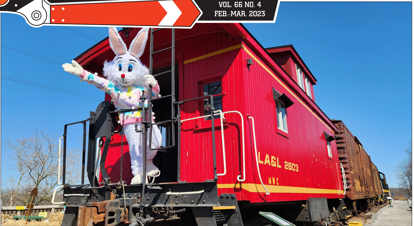
The Easter Bunny waves a friendly greeting from the rear of Livonia, Avon & Lakeville caboose 2603 (currently on loan to the museum) in the Upper Yard during our sold-out Easter Bunny Train Rides on April 8. See page 3 for details.