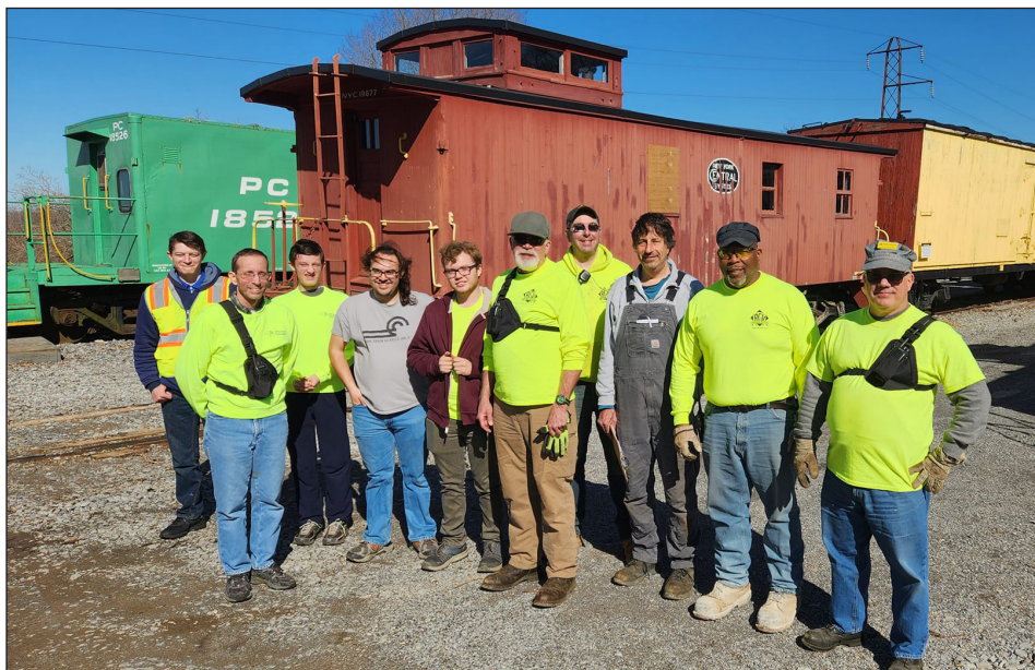
ABOVE: We held our first hands-on training session of the season for train crew volunteers on April 1.