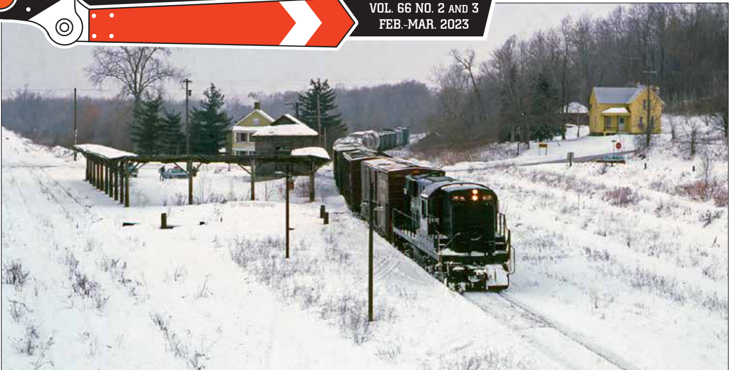
The Conrail local train serving the former Lehigh Valley Lima Branch is stopped at Rochester Jct. on February 14, 1919. The second car has derailed, so the crew has their work cut out for them. The former main line is at left, and the yard tracks at right are lost in the snow. Fire destroyed the station in 1973, the main line fell silent on April 1, 1976, and the Lima Branch was abandoned in March 1981.