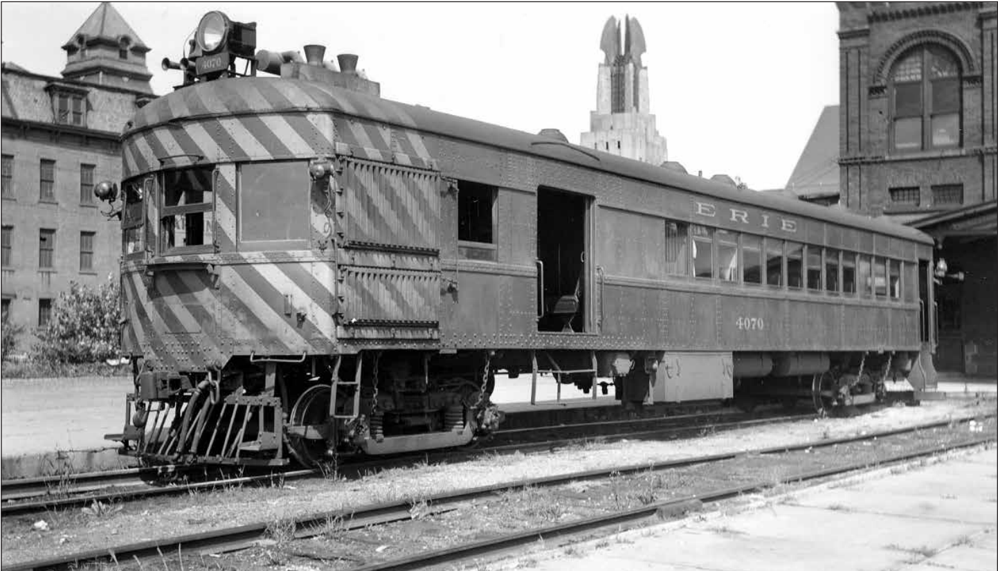
Erie gas-electric 4070 awaits its next assignment at the passenger terminal on Exchange Street, circa 1940. The “Wings of Progress” atop the Times Square building can be seen behind the car. Erie passenger service out of Rochester ended in September 1941.

Find us on Facebook! facebook.com/rgvrrm