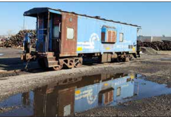
ABOVE: Ex-Conrail caboose 21290 was last seen on “live” rail on February 8 at Goodman Street Yard, awaiting delivery to Fairport.