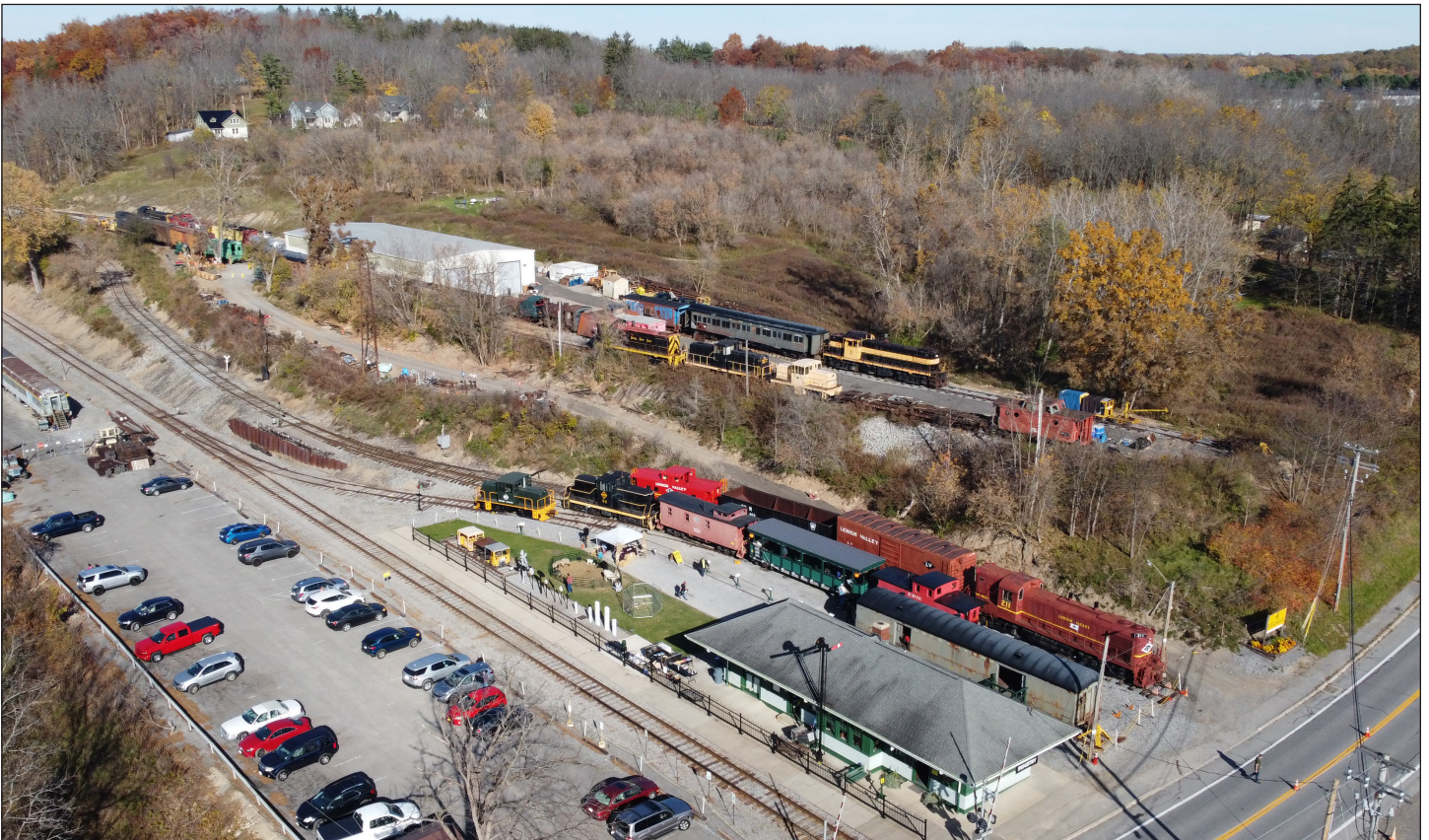
The last train of the season is about to depart Industry Depot on October 30 on a beautiful fall afternoon.

Find us on Facebook! facebook.com/rgvrrm