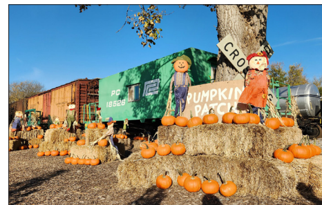
LEFT: Conductor Charles Bell waves from the rear of Erie C254 as the excursion train makes its way north past the signals at MP .3 on October 29.