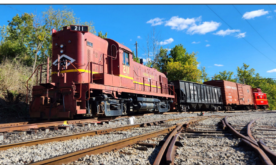
ABOVE: Our Lehigh Valley freight train exhibit on Track 5 was finally completed in September with the addition of Lehigh Valley 211!