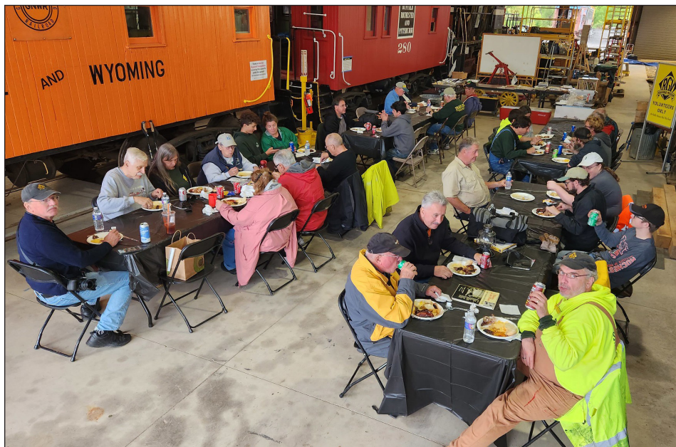
Museum members, friends, and family enjoying barbecue dinner catered by 3 Legged Pig of Lakeville during our Members' Day Celebration on the evening of September 25. See page 3.