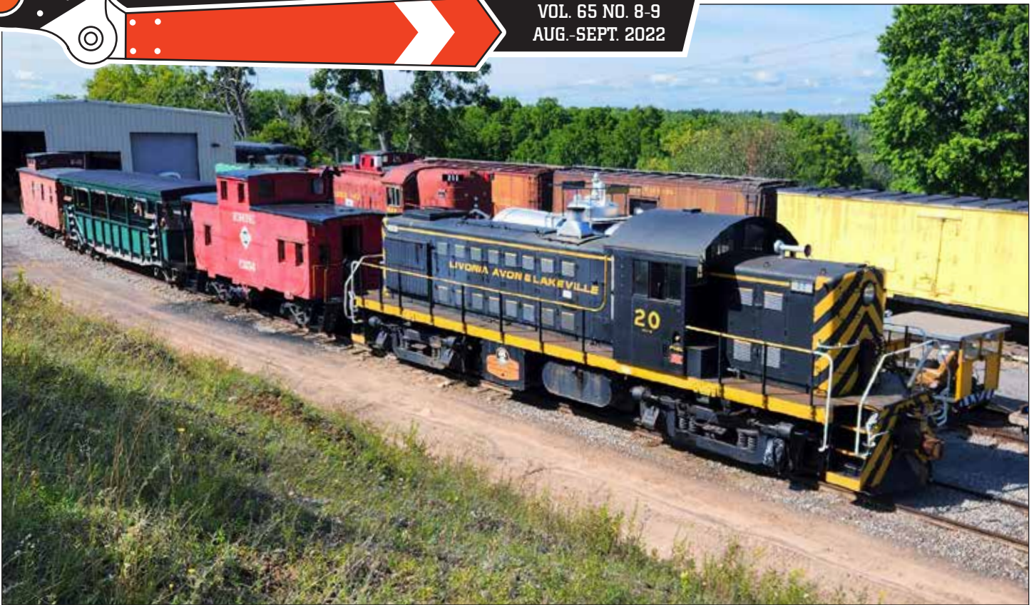
Former Livonia, Avon & Lakeville Alco RS-1 20 leads an excursion train out of the Upper Yard on the morning of August 21.

NEXT MEETING: September 15 Greg Lund presents "Pictures from the American West"