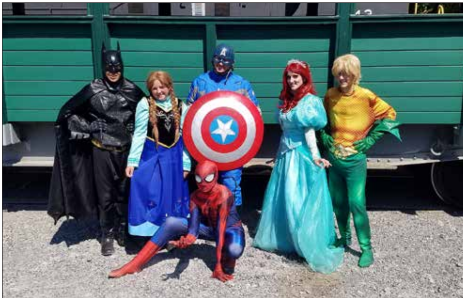
TOP LEFT: Our friends at Enchanted Princess Birthday Parties of Rochester provided great performers for our Princess & Superhero Train Rides on July 16 and 17!

VOLUNTEERS NEEDED Sign up now for September and October events rgvrrm.org/volunteer