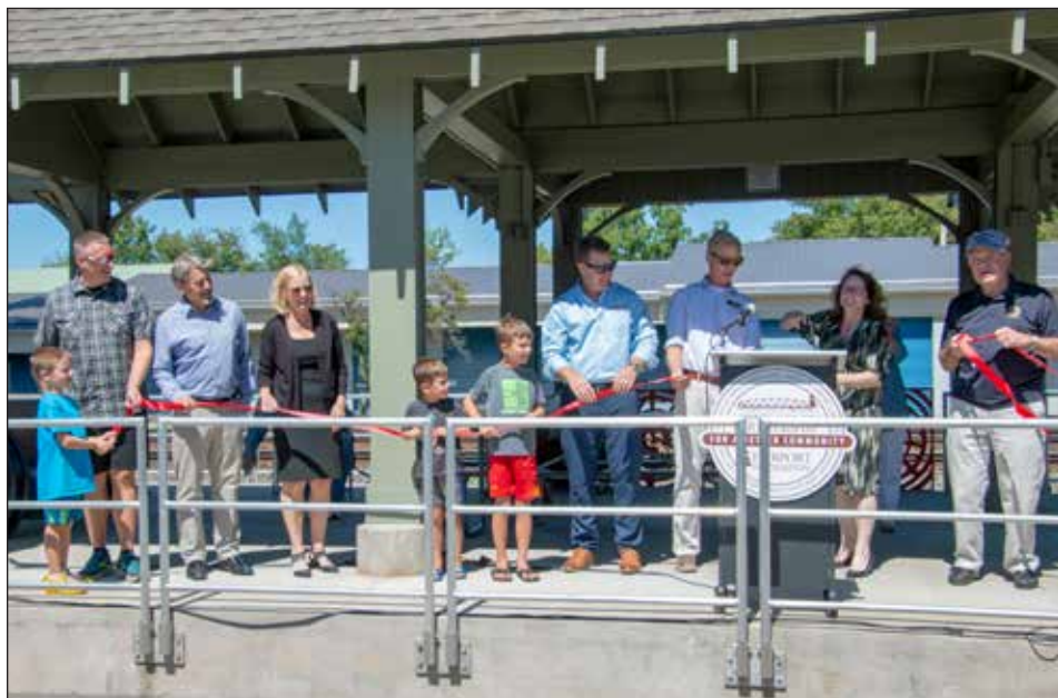
On August 12, some of our museum members attended the official ribbon-cutting ceremony for the Fairport Junction train viewing platform located in the public parking lot off Liftbridge Lane. During the ceremony it was announced that CSX is donating a caboose to exhibit. The train watching platform is also equipped with a live radio feed, and is a popular location to watch CSX and Amtrak action on the main line through Fairport.

meeting programs, please contact me. Any railroad-related program will be considered. Thanks for your help!