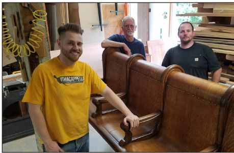
ABOVE: John H. Bailey Custom Furniture in Lima expertly rebuilt, restored, and refinished our Erie Railroad station bench.