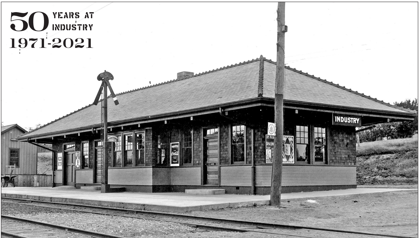
The new station as it appeared in 1909. The name of the station was changed to Industry on October 20, 1909. When the new station was built, the old Oatka station was moved over and became the freight house.