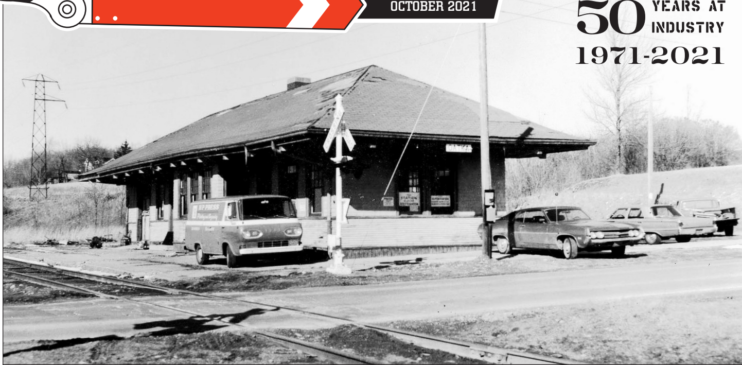
The first work sessions took place in 1972 to stabilize the train station at Industry that had been abandoned by the railroad for more than 20 years. Thanks to the efforts of countless volunteers and donors over the last fifty years, we have grown to become the largest operating railroad museum in New York State! Thanks to your support, we'll keep growing for the next 50 years, and beyond.