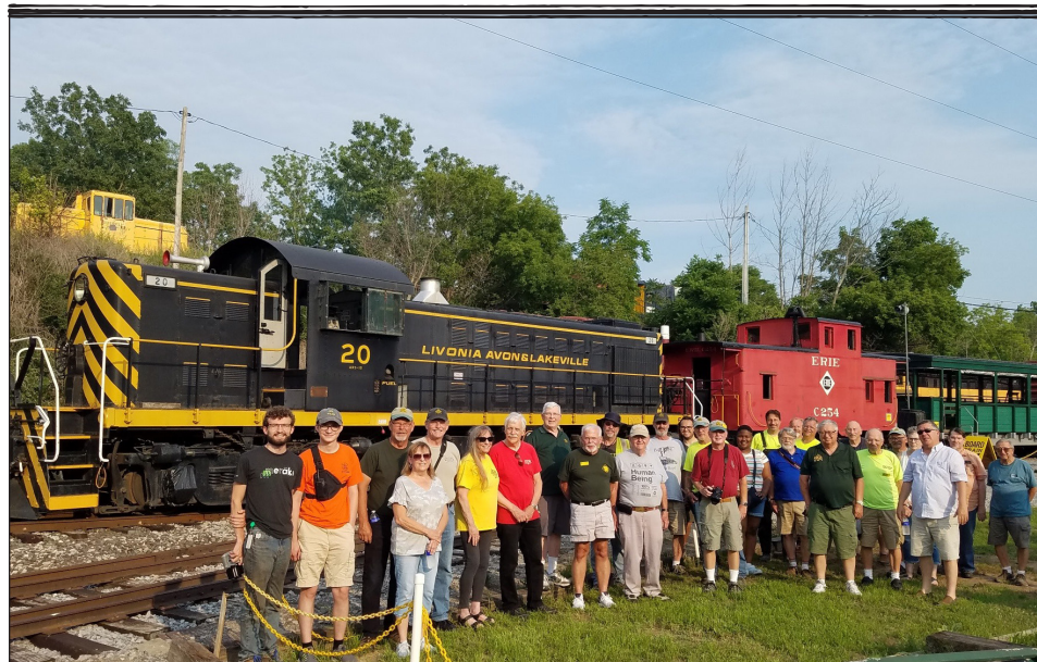
Our July 16 museum members' meeting featured train rides hauled by former Livonia, Avon & Lakeville Alco RS-1 no. 20, which was donated to our museum at the end of 2016.