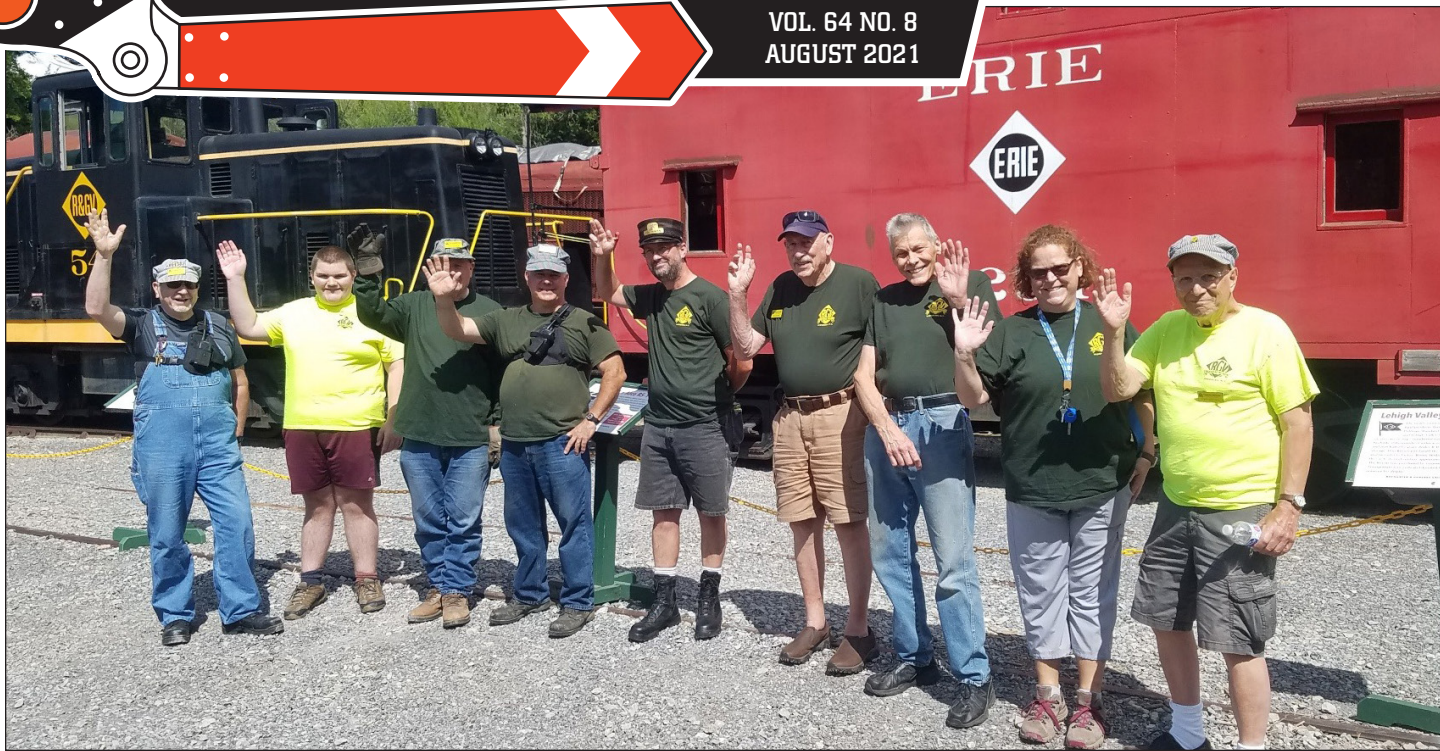
VOLUNTEERS MAKE IT HAPPEN! Old and new faces helped make our August 14 Trains & Trolleys at Twilight event a huge success. This was the busiest of the three, with more than 300 visitors carried throughout the evening. See story on page 3, photos on page 7.

NEXT MEETING: August 19 Take a Ride on Your Museum Railroad MEET AT 6:00PM