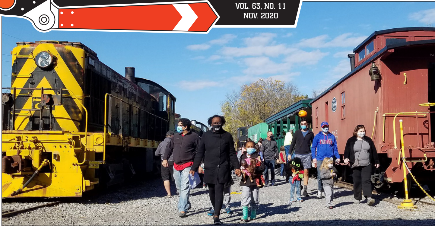
Visitors disembark in the Upper Yard to tour exhibits and visit the pumpkin patch. More than 1,800 paid customers visited the museum in October.

Annual Elections and "Riding With Norm Shaddick" presented by Duncan Richards