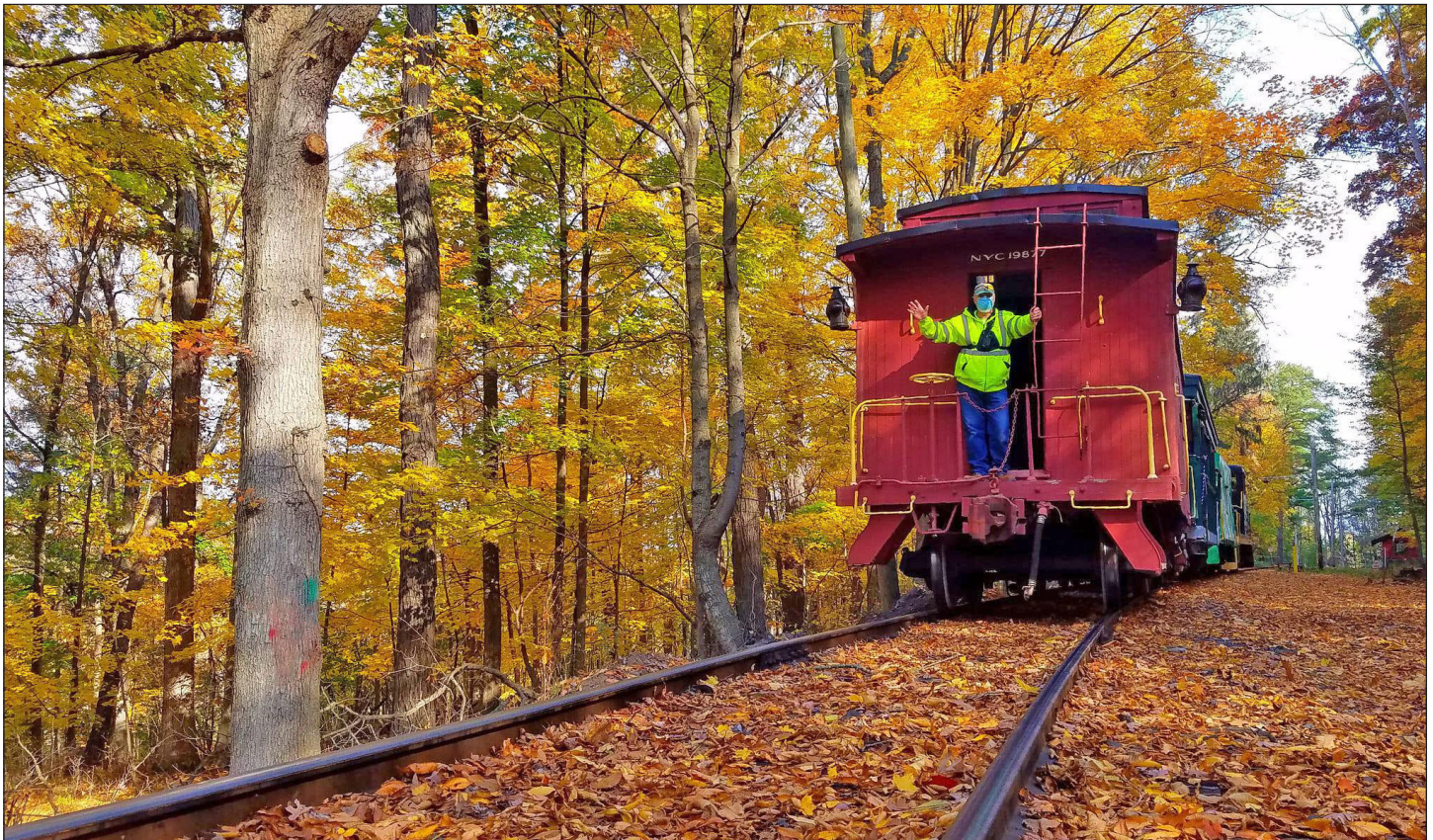
Conductor Charles Bell waves from the rear platform of our Pumpkin Patch Train paused at Midway on October 25.

Find us on Facebook! facebook.com/rgvrrm