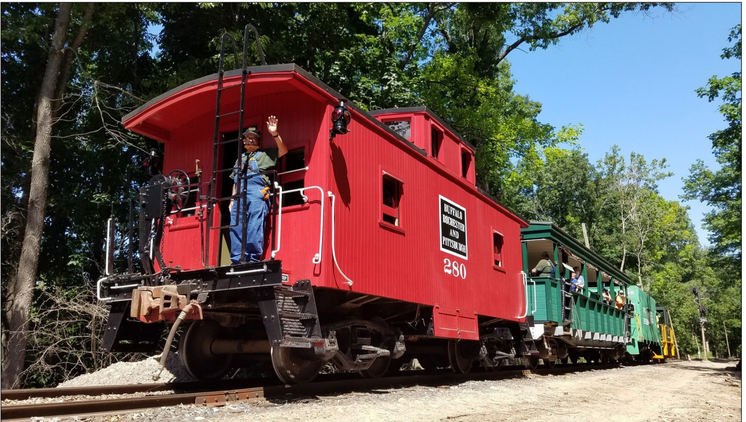
Our museum excursion train passes Signal 3N while conductor Joe Steimer waves from the rear platform of Buffalo, Rochester & Pittsburgh caboose 280, making its public debut on August 23! See page 5 for details.

Find us on Facebook! facebook.com/rgvrrm