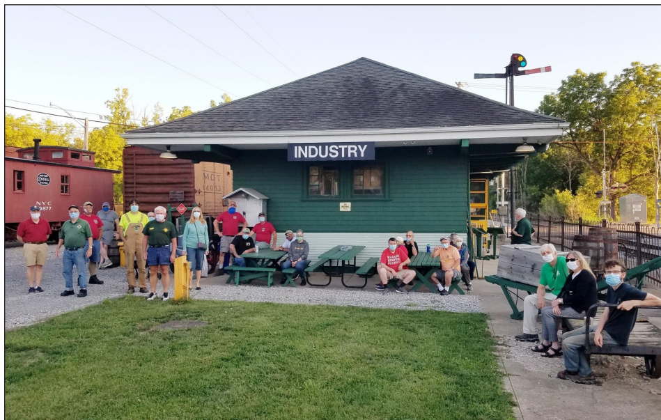
Our August 20 members-only meeting was our final summertime gathering at Industry Depot. Members enjoyed a ride on our museum railroad and a tour of our latest projects inside the Restoration Shop. Meetings return to the 40&8 Club in downtown Rochester in September.

We are currently seeking programs for our meetings on October 15 , November 19 , and December 17 . Programs can be on any railroad-related topic. Please contact Otto Vondrak at ovondrak@yahoo.com to reserve your presentation slot.