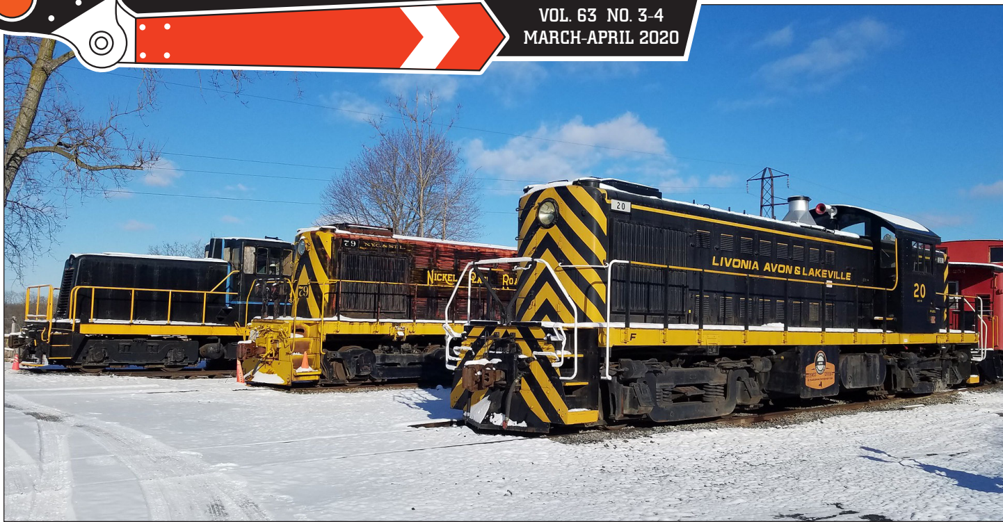
Kodak Park Railroad GE 60-tonner no. 6, Nickel Plate Road Alco S-4 no. 79, and former Livonia, Avon & Lakeville Alco RS-1 no. 20 bask in late winter sunlight in the Upper Yard on March 7, 2020.