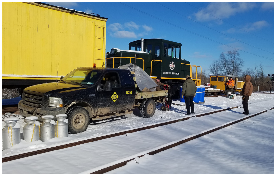
If you can't go to the power, the power will come to you! Work truck R&GV M250 was put to work on March 7 as a platform for our portable generator which was used to power the block heater and battery charger so RG&E 1941 could be used for switching that day.

The first priority of the Rochester & Genesee Valley Railroad Museum is the