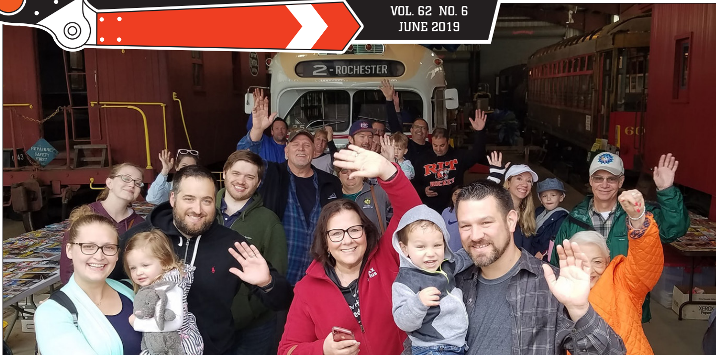
A little rain didn't dampen the enthusiasm of our visitors during our annual Father's Day Train Rides! Thanks to Regional Transit Service for loaning their restored 1956 GM Transit Bus for display throughout the weekend.

NEXT MEETING: June 20 ALL ABOARD! Enjoy a ride on your museum railroad!