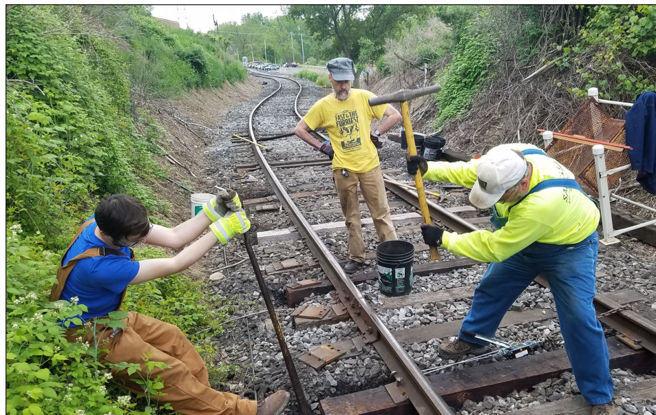
The Tuesday Night Track Gang has been busy replacing ties in the Hill Block through the month of June. Work will continue throughout the summer. New volunteers are welcome!

For the third year in a row, your museum enjoyed sold-out success for its popular Rails & Ales craft beer tasting event held on Saturday, May 18. More than 400 visitors enjoyed samples from fourteen local vendors including 810 Mead Works, OSB Ciderworks, RailHead Brewing, West Shore Brewing, Roc Brewing, Rising Storm Brewing, Sager Beer Works, Stonyard Brewing, Lost Borough Brewing, Blue Toad Hard Cider, Honeoye Falls Dis-