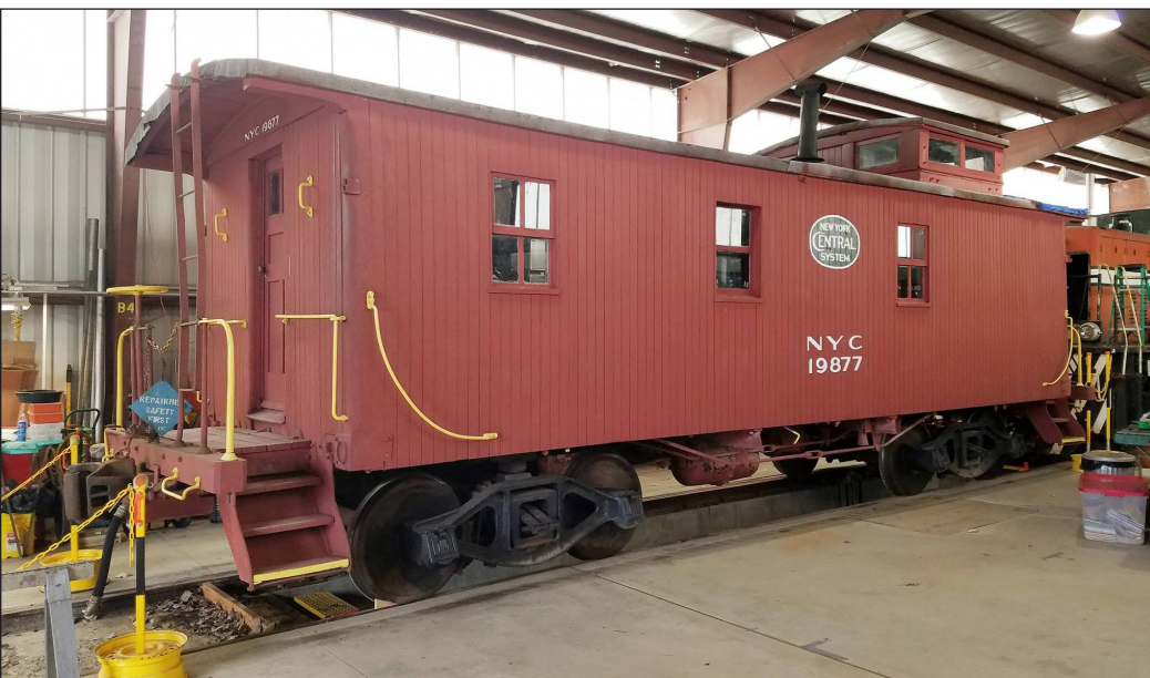
New York Central caboose 19877 (originally 19001?) has been placed in the shop to prepare for the installation of a new membrane roof and some light mechanical work.

rebuilt in 1935 as Class M70b, and finally in 1953 as Class BM70nb. Passed to PC in 1968, it joined the Conrail fleet in 1976 as part of the maintenance fleet. In 1994, the car was donated by Rochester Refrigeration Corp. to our museum. The car is currently home to our Signals exhibit, which opened to the public in 2017.