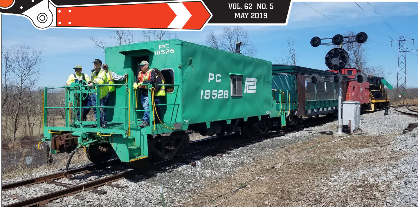
Conductor Jim Otto provides car counts to his engineer as the train backs down into the Hill Block towards Industry during our hands-on training session on April 13. Several first- and second-year trainees gained valuable experience throughout the day. Of course, any day we are running trains can be a training day! Training is not just limited to trains, we're happy to provide training for any of our heavy equipment, just ask!

NEXT MEETING: May 16 ALL ABOARD! Enjoy a ride on your museum railroad!