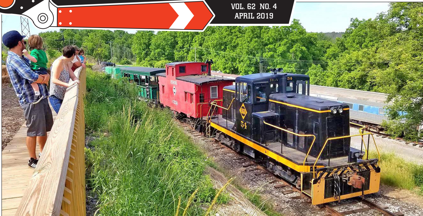
Visitors enjoy the view from the Railfan Overlook as R&GV 54 leads a three car train north through the Hill Block. In the last four years, your museum has opened up more of our grounds to the public, and made a number of historic artifacts accessible to the public for the first time.