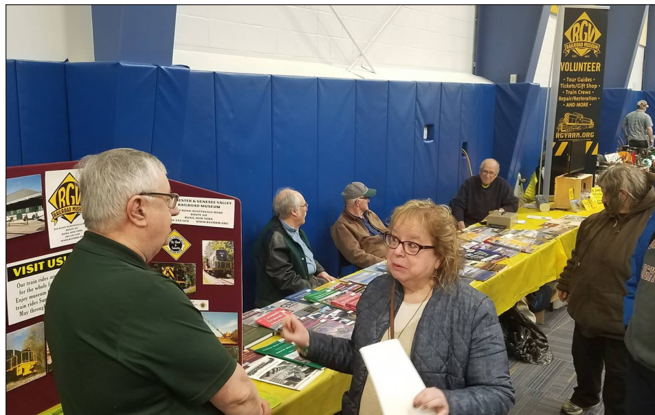
ABOVE: Your museum had a booth at the Great Batavia Train Show on March 31, where we sold museum merchandise and handed out fliers advertising our upcoming train rides.

Meetings return to Industry Depot starting May 16 . Starting a half-hour earlier at 7:00 p.m., following a brief business meeting we will enjoy rides on our museum railroad and a tour of current projects in the Restoration Shop. Warm-weather meetings