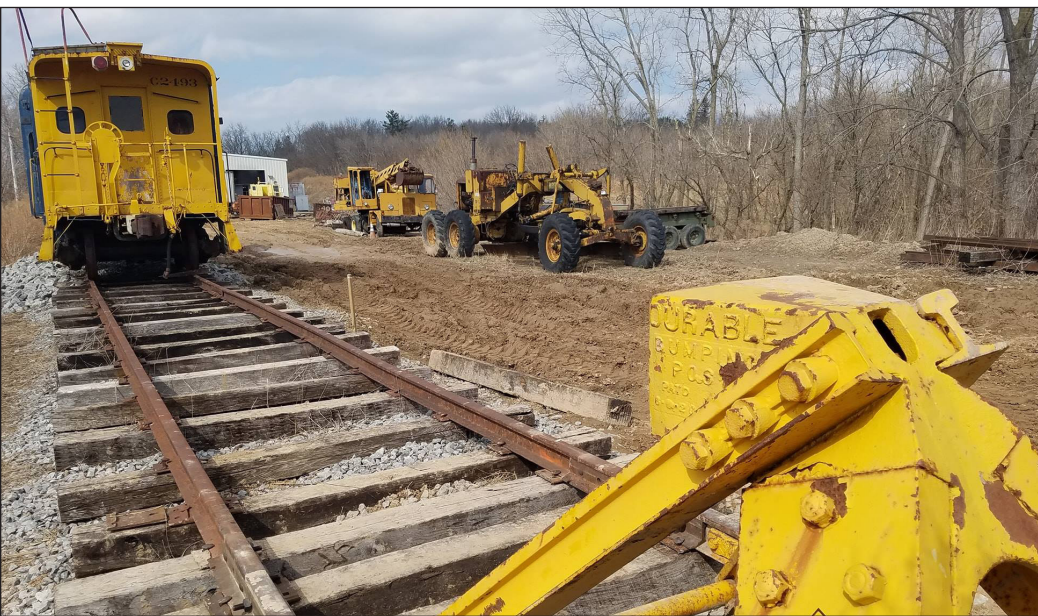
THE END: Volunteers under the supervision of Track & Right of Way Supt. David Kehrer installed a new bumper at the end of Track 6 behind the shop on April 6. This bumper was formerly located at the end of Track 4, which was replaced by removable wheel stops last summer.