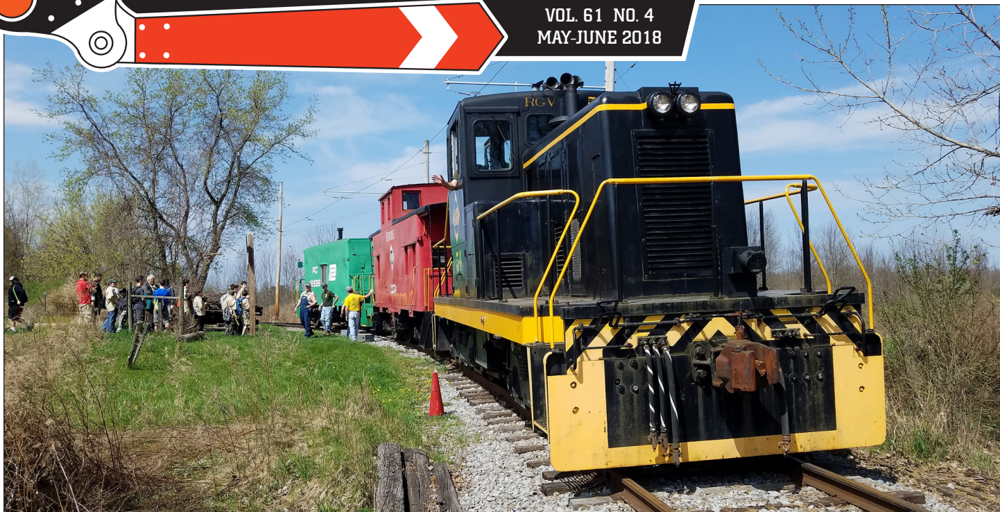
Our diesel trains ran a shuttle from BOCES Crossing to the Restoration Shop during the Black Creek District Spring Railroading Camporee on May 5. More than 150 local Boy Scouts visited RGV and NYMT to learn about the railroading industry and tour our museums.

NEXT MEETING: June 21 MEETINGS MOVE TO INDUSTRY DEPOT Enjoy Train Rides!