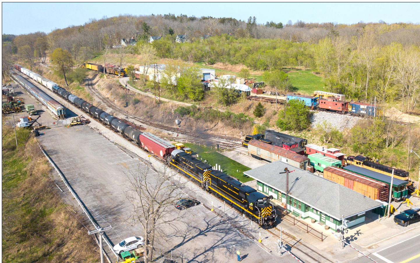
Visitor Joe Cermak sent his drone aloft on the afternoon of May 8, 2018, to capture this excellent photo not only showing the evening passage of the daily Livonia, Avon & Lakeville road freight, but also showing off our expansive museum campus and equipment collection.

project. While we are disappointed not to operate our New York Central Empire State Express coaches this year, your museum is working out the details for a replacement event to take place in late September.