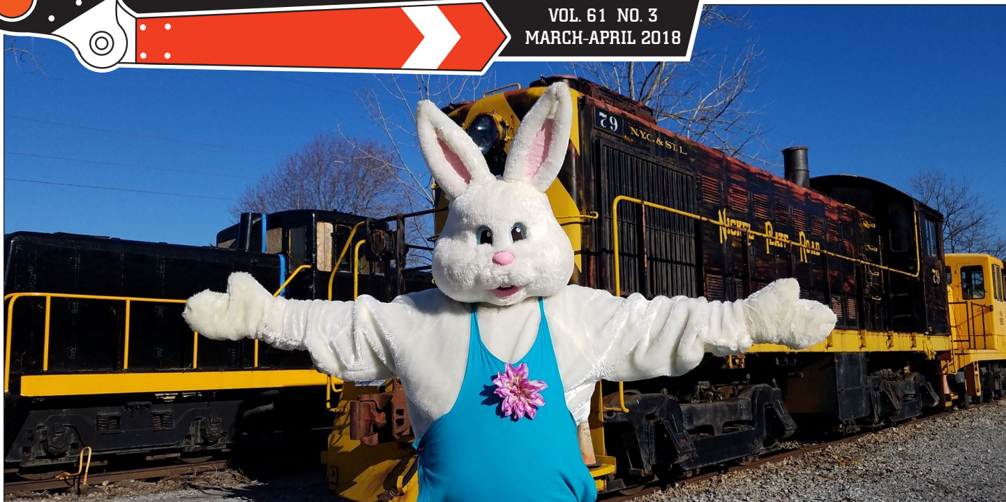
The Easter Bunny welcomed visitors to our first event of the operating season on March 31!