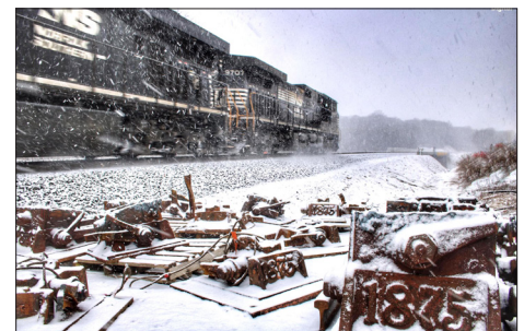
ABOVE: The bases of the old Portage Trestle have been set aside and earmarked for preservation.