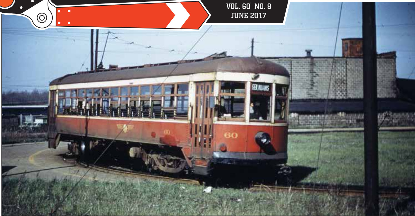
Rochester Subway Car 60 prepares to depart the loop terminal at General Motors Rochester Products plant for another trip into the city and the suburbs of Brighton in June 1956. Our June 17-18 event focuses attention on our efforts to restore Car 60 for future generations to enjoy.