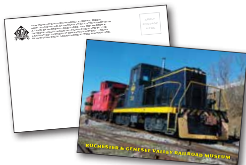
R&GV MUSEUM POSTCARDS