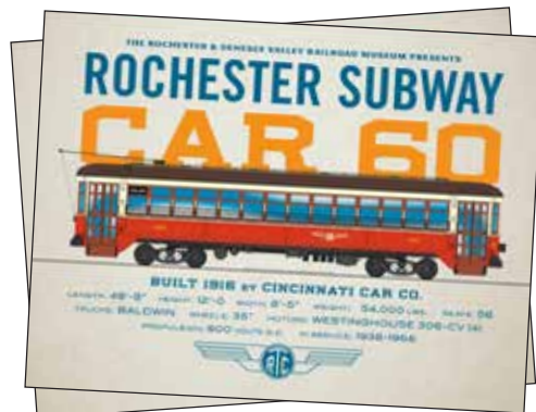
SUBWAY CAR 60 LIMITED EDITION 24x18 POSTER