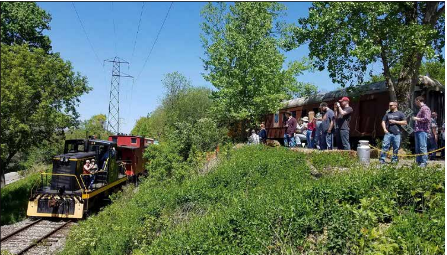
During our successful "Rails & Ales" event on May 20, we converted the "Pumpkin Patch" into a "Beer Garden." Visitors enjoyed relaxing on the benches and watching our trains run up and down the Hill Block. This will be the future location of our "Railfan Overlook" and observation deck.

Find us on Facebook! facebook.com/rgvrrm