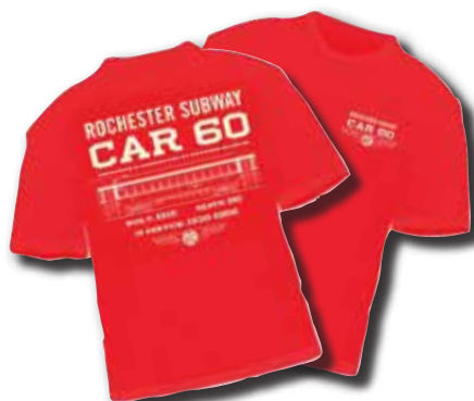
SUBWAY CAR 60 LIMITED EDITION T-SHIRTS