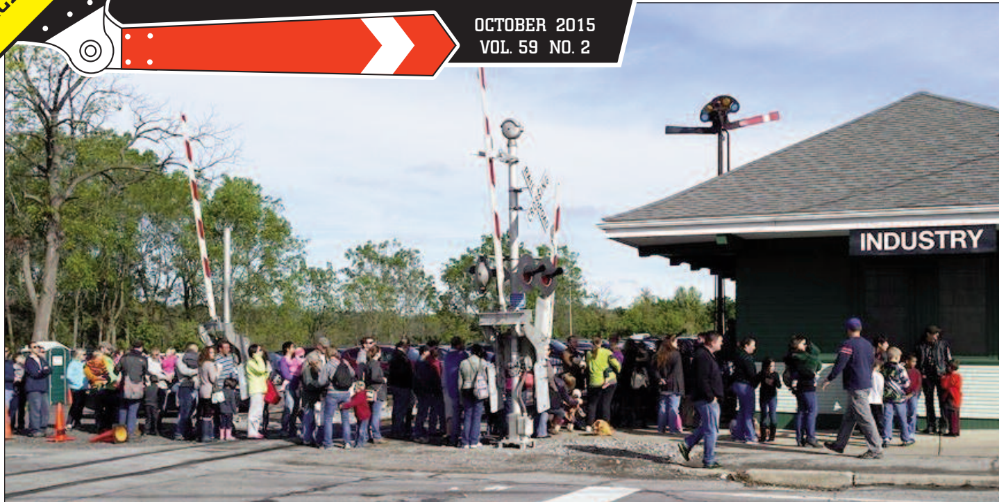
HIGHEST ATTENDANCE RECORD EVER was on October 3-4 weekend for our Pumpkin Patch Train Rides. Wait times were a little longer than usual, but everyone was served, with every single departure sold out.