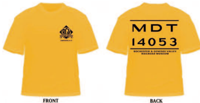
No. 3 "MDT 14053" ORANGE/BLACK