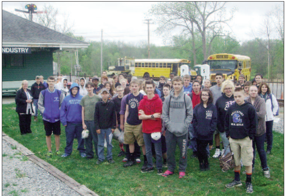
Our first museum visitors of the year were from Brockport's Oliver Middle School on May 13. The school field trip enjoyed a museum tour and a train ride.