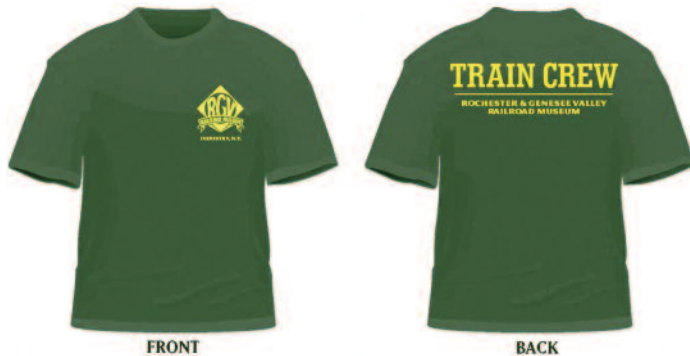
No. 1 "TRAIN CREW" DARK GREEN/YELLOW (RGV MEMBERS/VOLUNTEERS ONLY)

Be stylish, be safe, support your museum, support your favorite project, identify yourself quickly to volunteers and other train enthusiast... No matter what your reason, R&GV Railroad Museum t-shirts are the "in" fashion this season! Help us determine how many to order so we can have them ready by the next membership meeting in June. We will also have some limited quantities for sale in our gift shop at Industry Depot! Shirts are $15.00 each. Please submit your order BEFORE JUNE 6. Email to ovondrak@yahoo.com or mail your order with payment to P.O. Box 23326, Rochester, NY 14692-3326. WE CANNOT SHIP SHIRTS AT THIS TIME. They must be picked up in person.