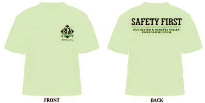
No. 2 "TRAIN CREW" HI-VIZ GREEN/BLACK (RGV MEMBERS/VOLUNTEERS ONLY)