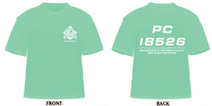
No. 4 "PC 18526" JADE GREEN/WHITE