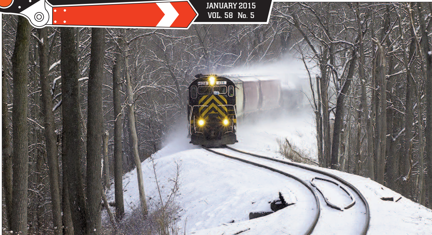
Livonia, Avon & Lakevilleno. 428 is kicking up the powder at the S-curves as it leads the northbound road freight at Pole Bridge Road in Avon, N.Y., on December 30, 2014. The LA&L is celebrating 50 years of service in 2015.