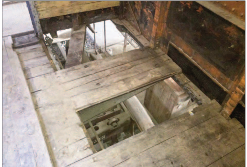
Even in the dead of winter, work continues on our Lehigh Valley caboose! Charlie Marks is squaring up the holes for new wooden planks on January 10, 2015. He has also cut the holes back to line up over a floor brace.