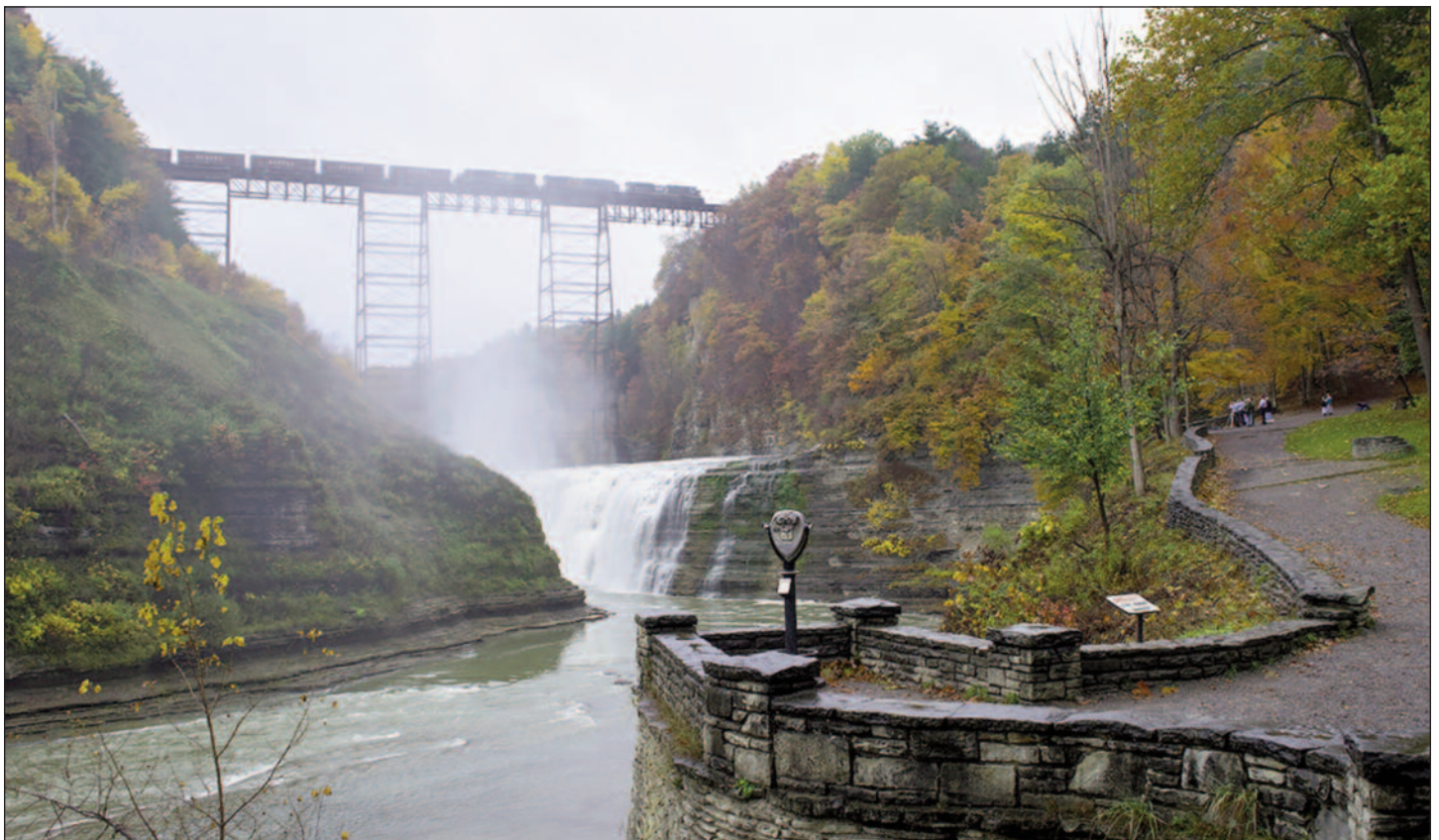
An NS SD70ACe leads a train of Herzog hoppers across the Portage Bridge on a wet, rainy morning in Letchworth State Park on October 17, 2014. The new Portageville Bridge project has been approved, construction will start during the summer of 2015 (see page 2).

— Like us on Facebook: facebook.com/rgvrrm —