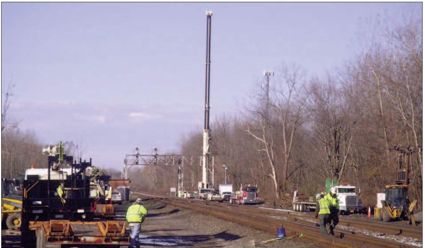
The latest round of CSX signal upgrades took place November 2-3 on the former New York Central main line between Pixley Road and Chili Jct. (CP 382). The upgrades are part of the federally mandated upgrade program for all railroads that handle hazmat and scheduled passenger train movements. The new signals rely on LED lighting and do not have any moving parts, saving on maintenance.

— Like us on Facebook: facebook.com/rgvrrm —