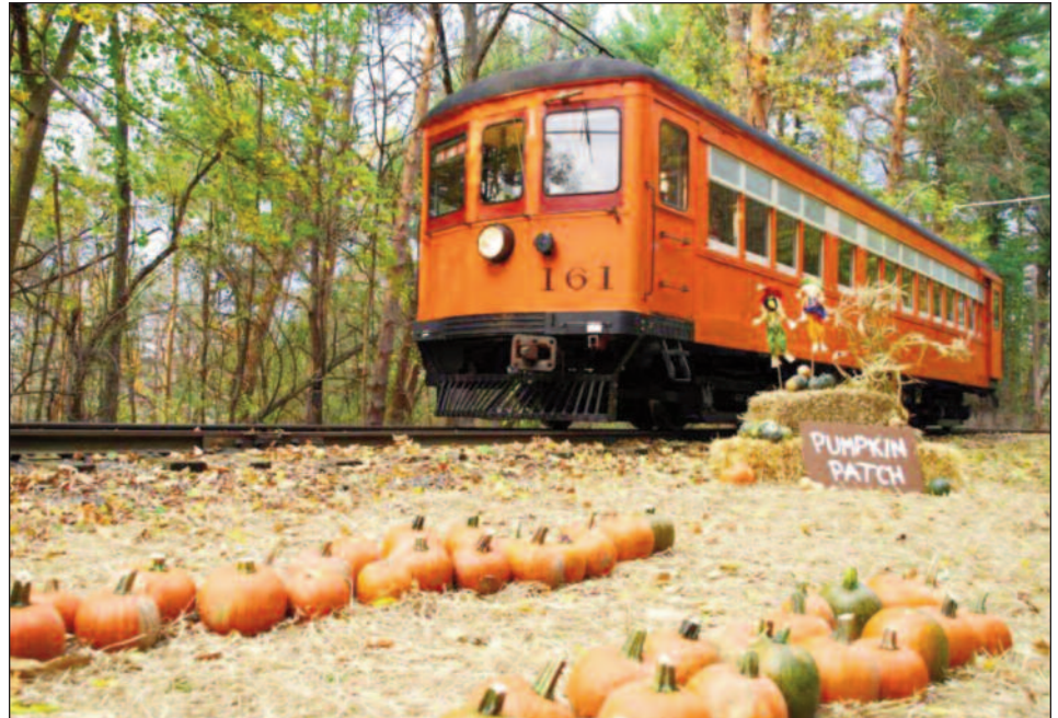
Pumpkin Patch Halloween Trolleys run in coordination with NYMT on October 25 were another sell-out success, and will be repeated in the future.