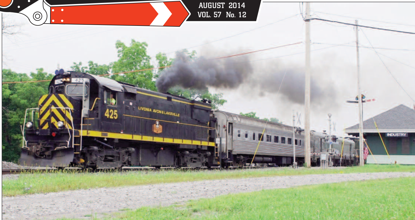
The Livonia, Avon & Lakeville Railroad borrowed one of our coaches and power car so they could run a special train for the family of one of the railroad's founding officers who passed away in 2011. The coaches were picked up the morning of Sunday, August 4, (ABOVE) and brought to Lakeville for loading. The trip ran the entire length of the railroad to Jefferson Road in Henrietta. See page 5 for details.

NEXT MEETING: August 21 Meeting at Industry Depot: Ride your museum railroad!