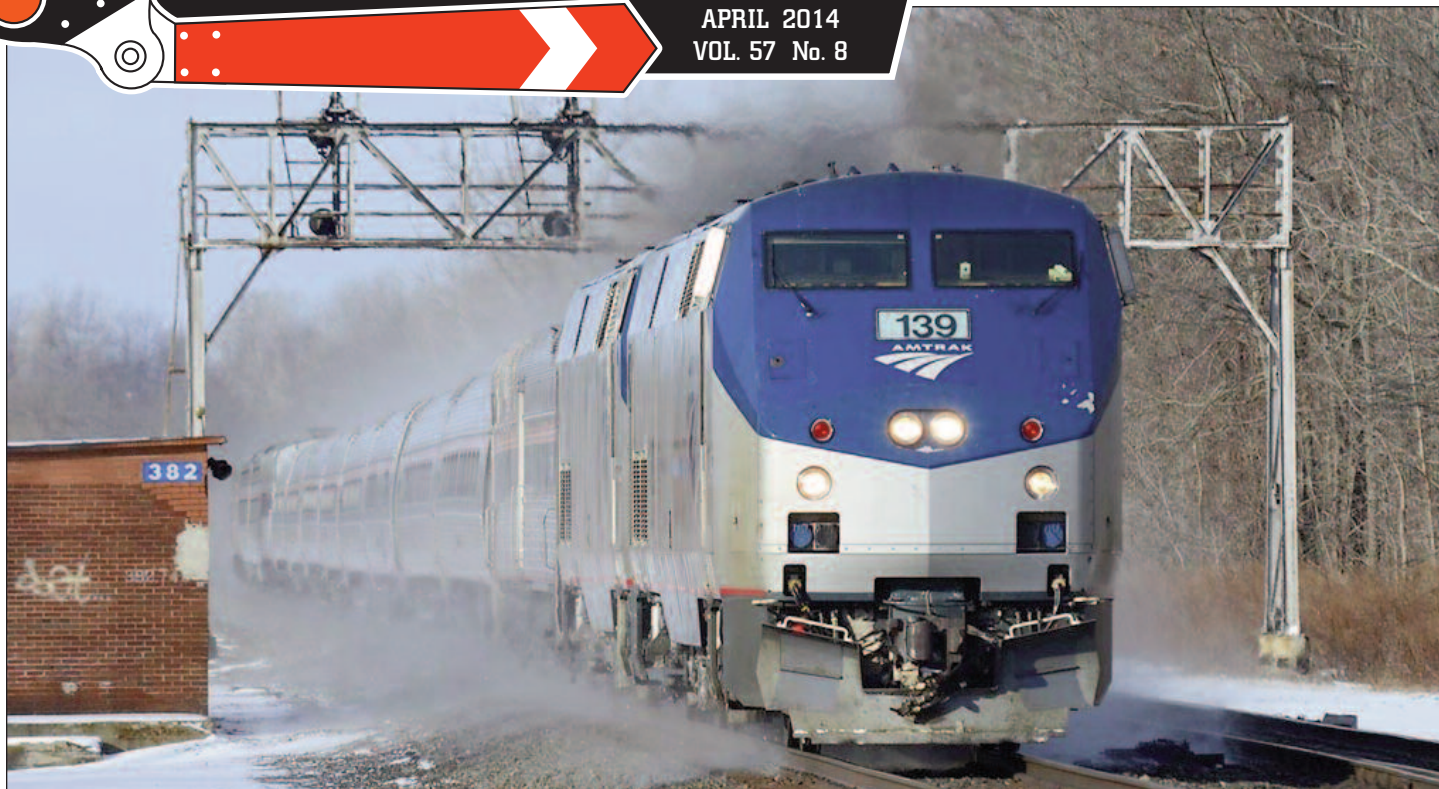
ROCHESTER, NEXT STOP: Amtrak 48, the Lake Shore Limited, speeds through the interlocking at CP 382 near Attridge Road on February 5, 2013. CSX is on a campaign to replace all of the New York Central-era signal bridges in this territory.