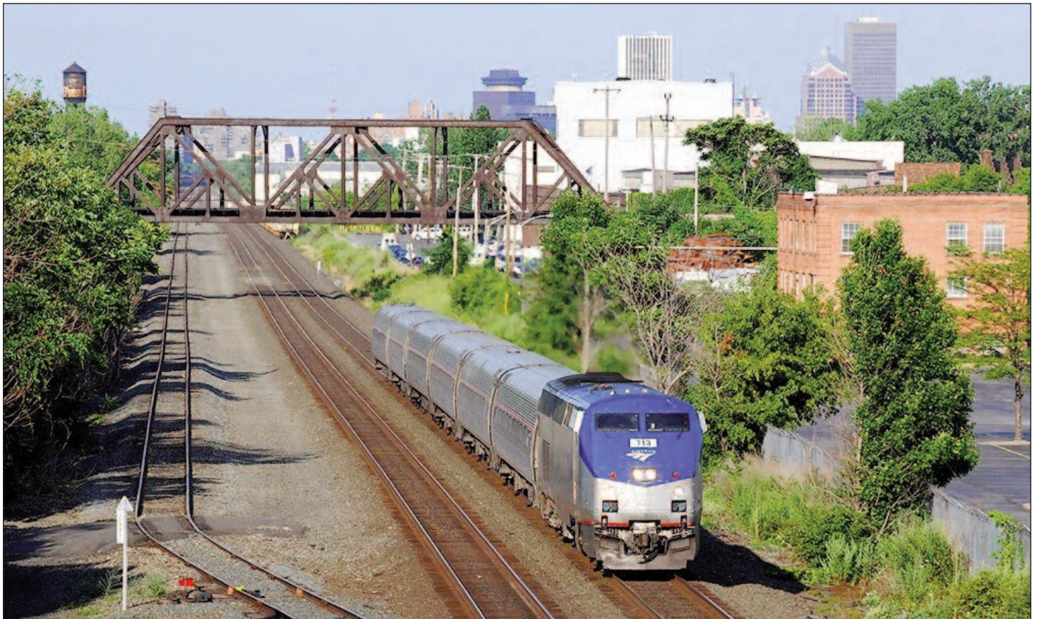
The last westbound Amtrak train of the evening rolls past the old General Railway Signal plant and under the old B&O bridge, with the Rochester city skyline in the background on July 21, 2012.

— Like us on Facebook: facebook.com/rgvrrm —