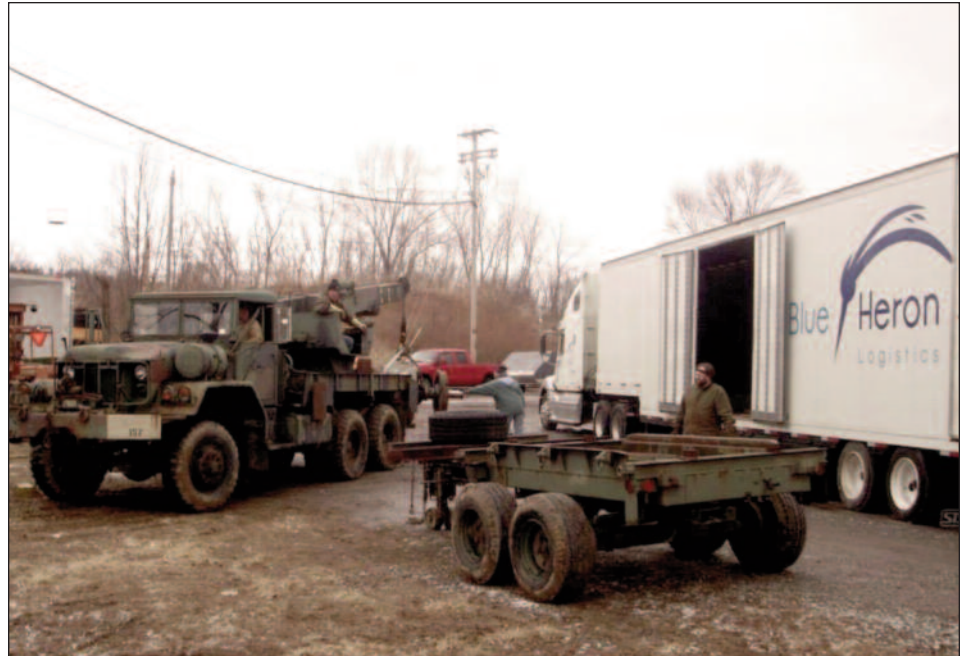
Two new traction motor combos were delivered from Indiana to Industry on Saturday, April 5, thanks to our friends at Blue Heron Logistics! These parts will be used to repair R&GV 1654, which was damaged while being shipped to us in 2001.