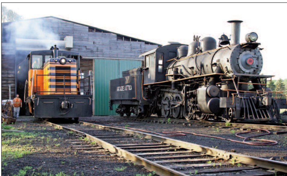
The Arcade & Attica operates New York State's only regularly scheduled steam-powered passenger excursions. Join the museum for a special tour to the A&A on June 7, 2014.

Our motorcoach will depart Arcade at approximately 3:00 p.m. traveling to the Lumberyard Restaurant in Perry, N.Y., for