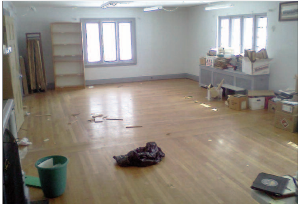
On March 13, 2014, we hired Sheridan Movers to take our boxed up library collection and place it in storage. We must find a new home for the library collection since the build the 40 & 8 Club is housed in will be renovated for other purposes. OTTO VONDRAK