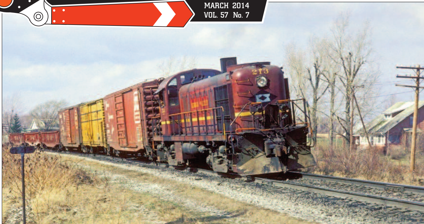
With Alco RS-2 #213 in the lead, Lehigh Valley's Geneva Local is eastbound making good speed on the superelevated curve near Lodi, N.Y., in late March 1976. In just a matter of days, trains will no longer run through here once Conrail takes over on April 1. We are fortunate to have preserved many artifacts from the LV, including rare high-hood RS-3 #211 and caboose 95100.