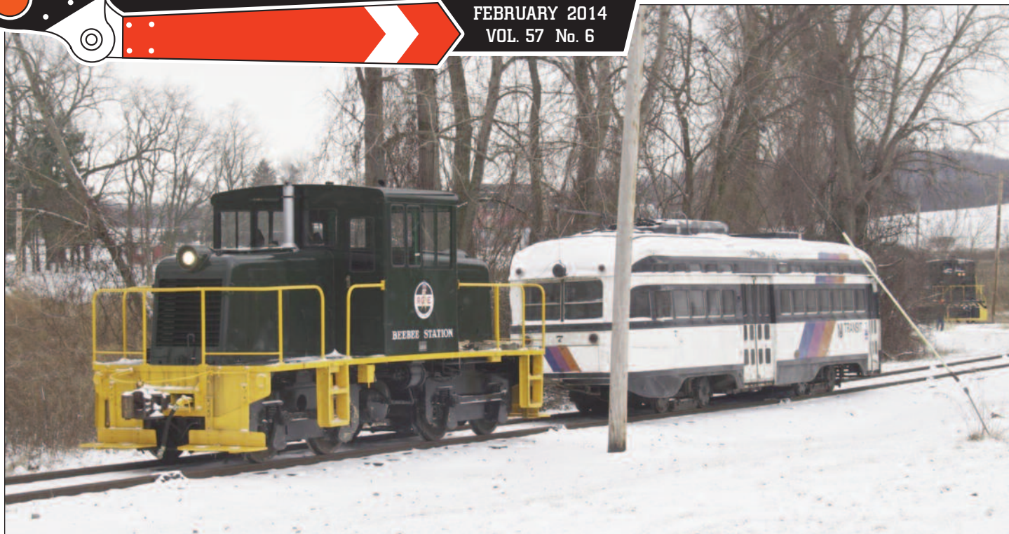
RG&E 1941 leads NJ Transit PCC 7 towards its new home at the New York Museum of Transportation on January 18, 2014. R&GV 1654 can be seen following a safe distance behind between the Loop Switch and Giles Crossing. This streamlined trolley is one of 30 that served for nearly 50 years on the Newark City Subway until retired in 2001. The car is an excellent candidate to carry visitors on our shared museum railroad.