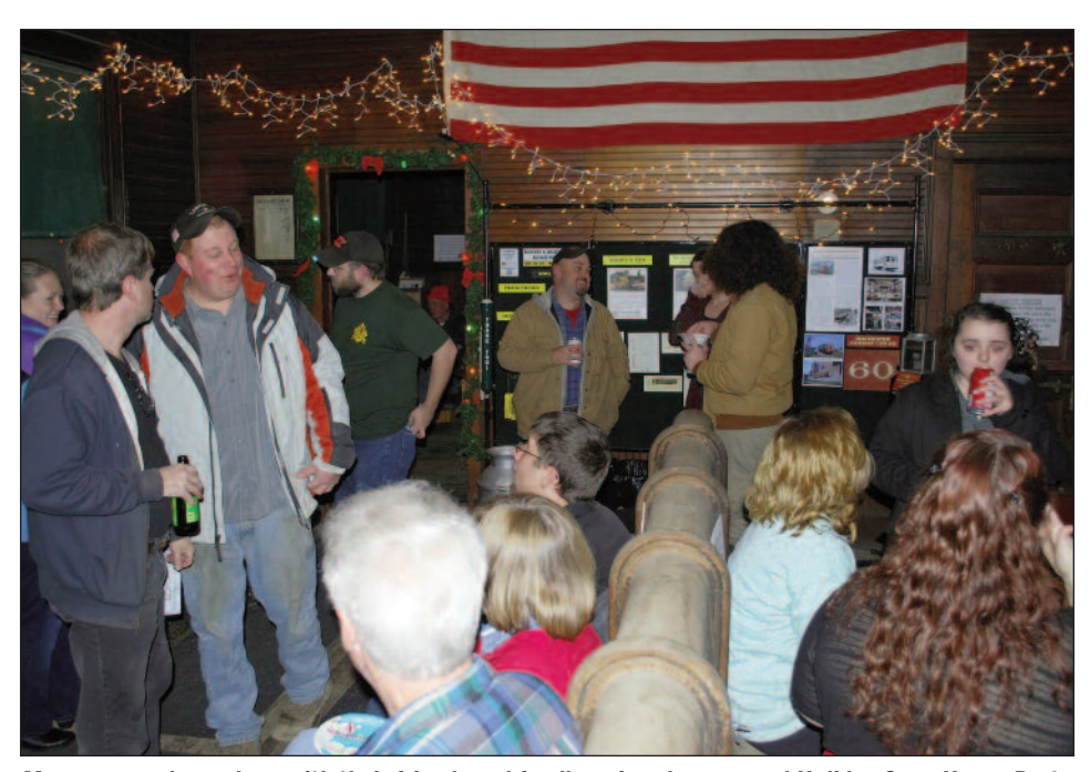
Museum members, along with their friends and family, enjoyed our annual Holiday Open House Party at Industry Depot on Saturday, December 7. There was hot cider on the stover, delicious dishes to pass, and warm holiday music throughout. A great way to welcome the holidays!

The role of Museum Manager was created many years ago when the museum was just a single line item in the Rochester Chapter's sprawling list of budgeted activities. Since then, not only has the museum evolved, but the position as well.