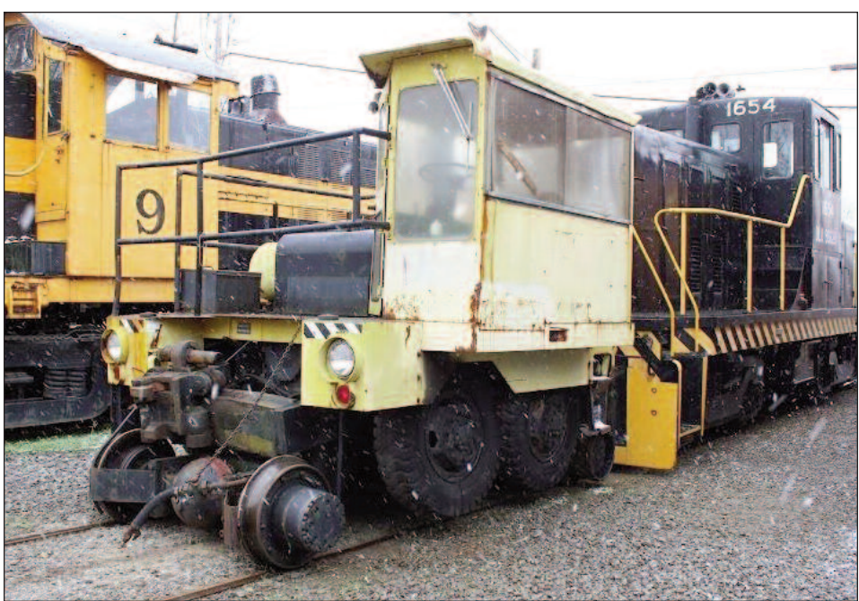
TOP: On November 23, volunteers from R&GVRRM headed north to help out our partners at NYMT to do a little rearranging of their storage tracks in front of the car barn. ABOVE: During the first week of December, NYMT's 9TM Trackmobile was officially transferred to R&GVRRM. Christened "L-3" in a tounge-in-cheek honor to the Rochester Subway's own small diesel switcher, this Trackmobile has already helped switch out several pieces at Industry.