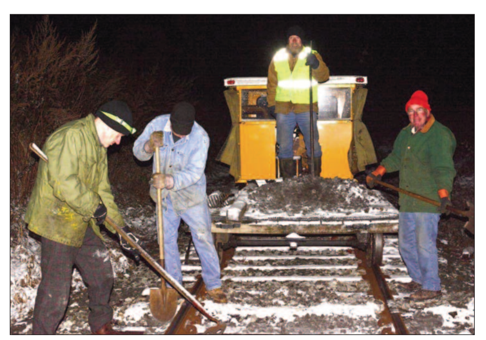
Nothing stops the Tuesday Night Track (TNT) Gang! Not even the cold of winter, or the dark of night, or the blinding flash of reflective vests! Their goal is to replace 50 ties in the main line before year's end (and they'll probably make it, too).