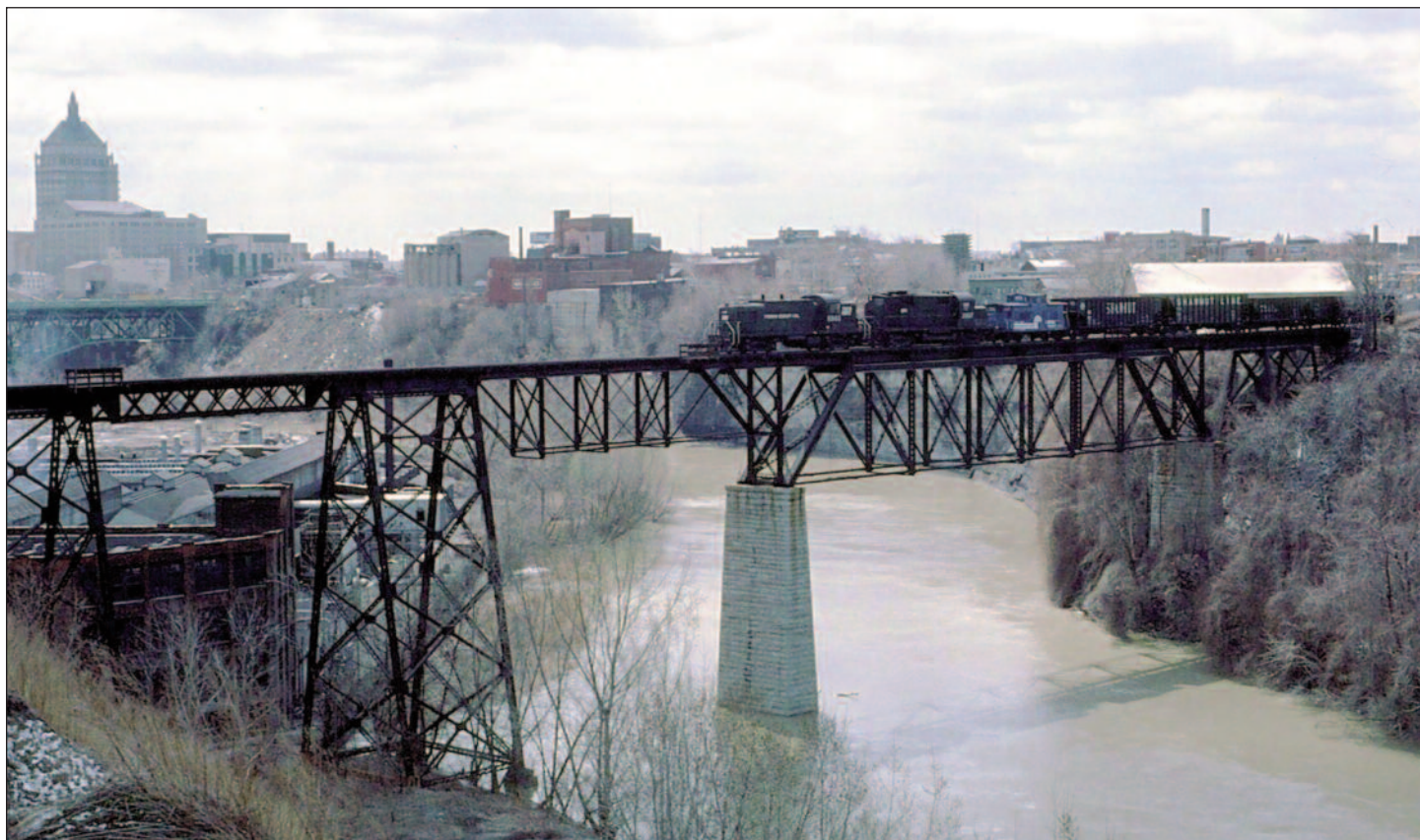
Former Penn Central diesels lead a Conrail coal drag across the old Rome, Watertown & Ogdensburg bridge spanning the Genesee River towards the small yard at State Street for RG&E's Bee Bee Station, sometime in 1980. The route and bridge were abandoned in 1996.

DONATE TODAY! Visit www.rgvrrm.org/support