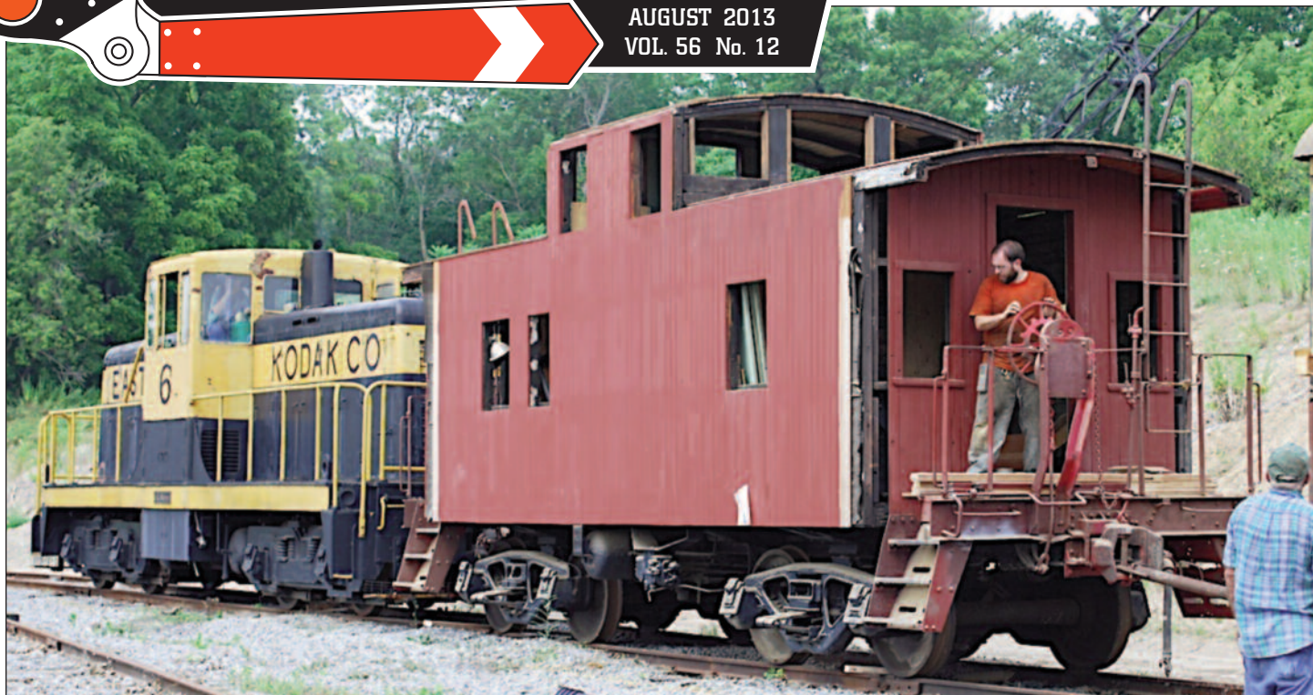
In 2009 we used EK 6 to shuffle some items around in the upper yard and the Restoration Building to make room for things, while we shifted some newer things forward, and older things backward.