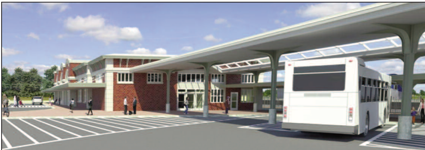
Rendering shows proposed Phase 2 bus terminal built on to the new Amtrak station. Construction has been scheduled for spring 2014. nysdot