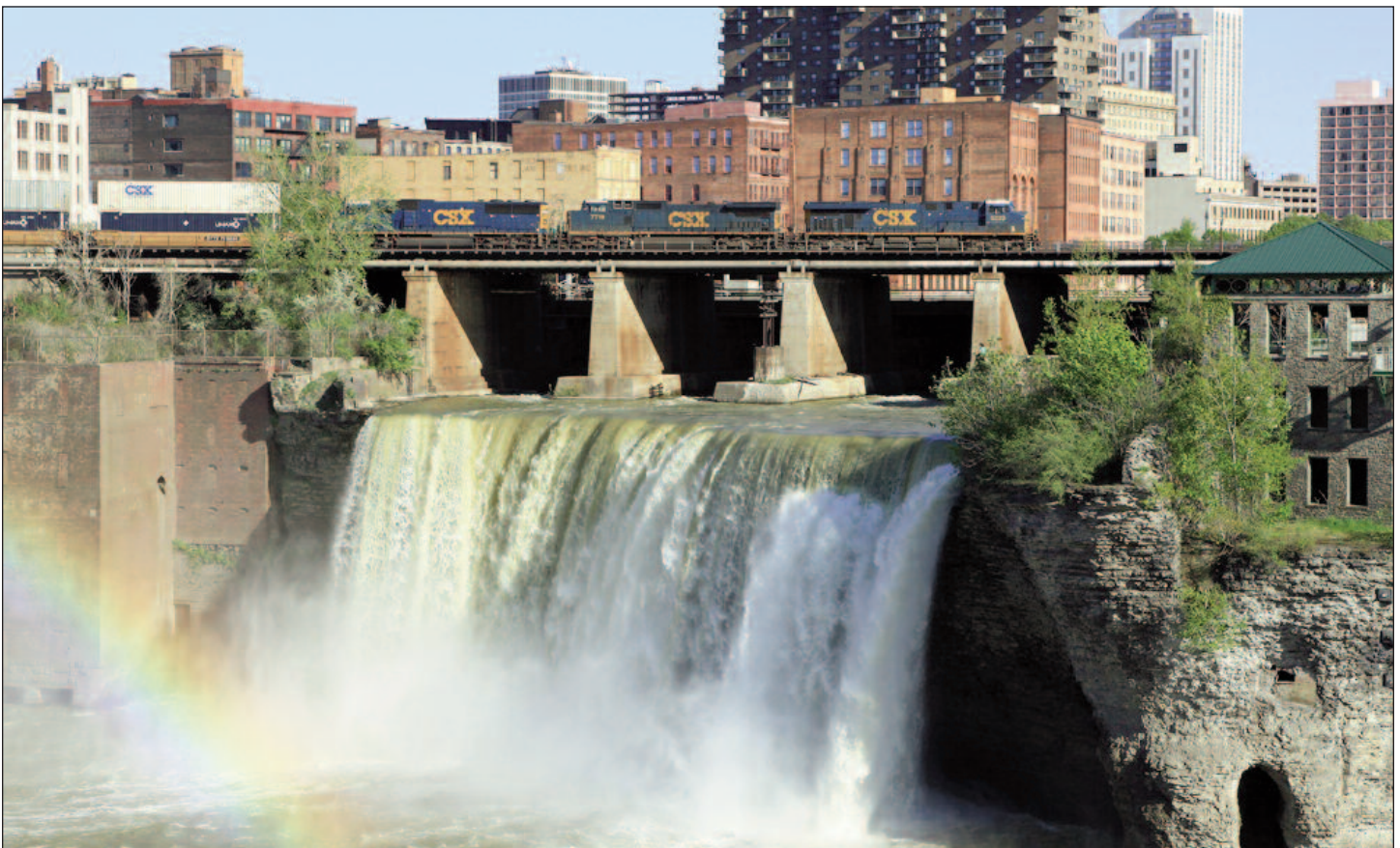
CSX 5323 leads a westbound freight over the High Falls in downtown Rochester on a warm summer evening in 2012.

— find us on Facebook: facebook.com/rgvrrm —