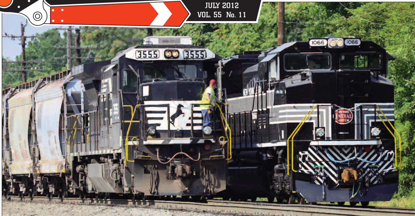
YOU'RE NOT SEEING THINGS: Norfolk Southern train 11R with New York Central 1066 leading gets a look over by the local crew switching in Hagerstown, Maryland, on June 19, 2012. The NYC unit is one of 20 heritage tributes created by Norfolk Southern to celebrate their 30th anniversary. The units will gather at the North Carolina Transportation Museum in July for a "family portrait."