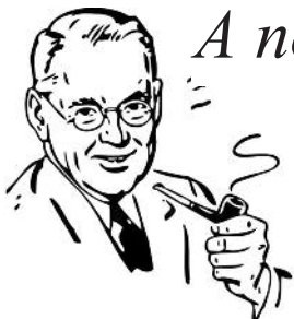
A bit of advice...