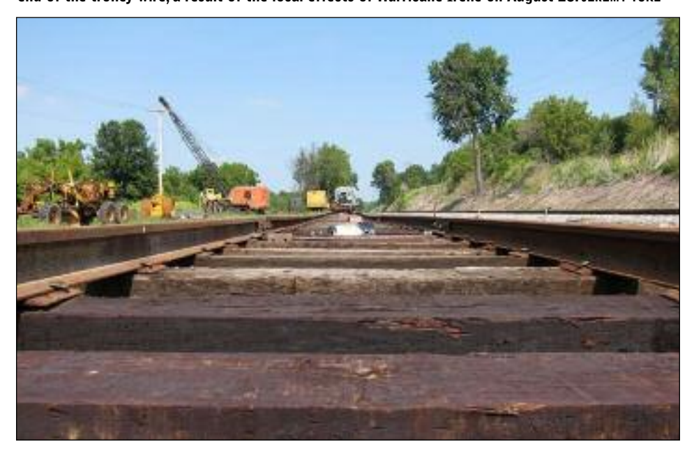
Spikes as far as the eyes can see on September 3! The extension to our passenger car siding has been completed. Now we need to get the ballast deliveries started, but we need your help. Please consider giving to our Donate-A-Ton fundraiser (Online at rgvrrm.org/support). A $20 donation buys a TON of stone and we need at least 150 tons! Please help us continue the progress!

Union Station Museum. We got to talking, and he mentioned that he had tried unsuccessfully to contact our museum, but was not successful. When I introduced myself and let him know where I was from, he immediately donated the sign along with