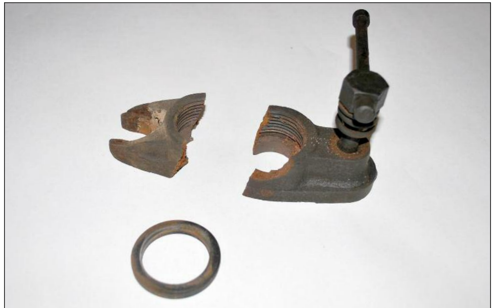
An inspection of the sand delivery pipes on R&GV 1654 revealed that three of the pipes had been completely worn through (TOP). The fourth had been completely ripped off, damaging the pipe mounting flange (ABOVE). All will be repaired and replaced, allowing 1654 to have a functioning sand delivery system once more. Compressed air forces dry sand through pipes directed toward the bottom of the wheel treads to help add traction when encountering slippery rail or steep grades.

automatic drains for our new main reservoirs. We've already received quotations on new valves. We are also looking into acquiring a set of used valves.