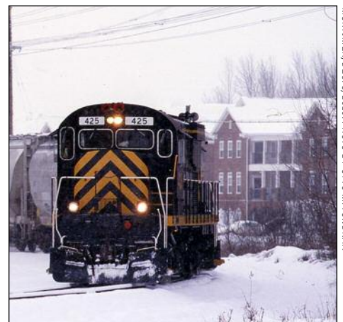
MORTIMER, DEC. 6, 2010.

MATERIALS SUBMISSIONS: We welcome your contributions to The Semaphore ! Any materials related to the activities of the Rochester & Genesee Valley Railroad Museum, as well as the history of Rochester's railroads are welcome for publication in the Semaphore . All written materials should be submitted as Microsoft Word or plain text documents, and all photographs as high-resolution JPEG files. Materials and inquiries should be emailed to the Editor at ovondrak@yahoo.com or call (585) 820-2341.