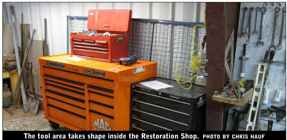
The tool area takes shape inside the Restoration Shop.