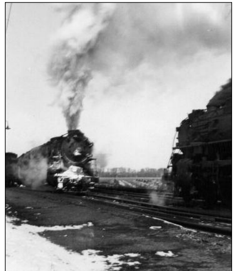
MYSTERY AT MT. MORRIS: What appears to be Lackawanna trains 6 and 15 meet at Mt. Morris, circa 1940. For the rest of the story, turn to page 6.