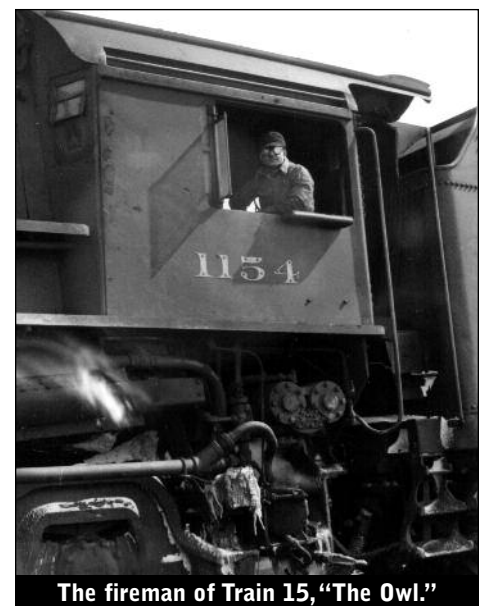
The fireman of Train 15, "The Owl."