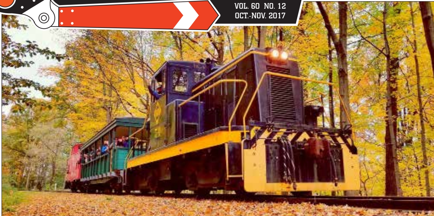
Our Pumpkin Patch Train Ride is surrounded by beautiful fall foliage up near Midway station. Our 2017 event broke all previous records for single-day attendance, thanks in part to being featured on WHAM-13's "Good Day Rochester" with Ashley Doerzbacher the week previous.

NEXT MEETING: November 16 ELECTIONS NIGHT Devan Lawton presents "Coast to Coast Railfanning"