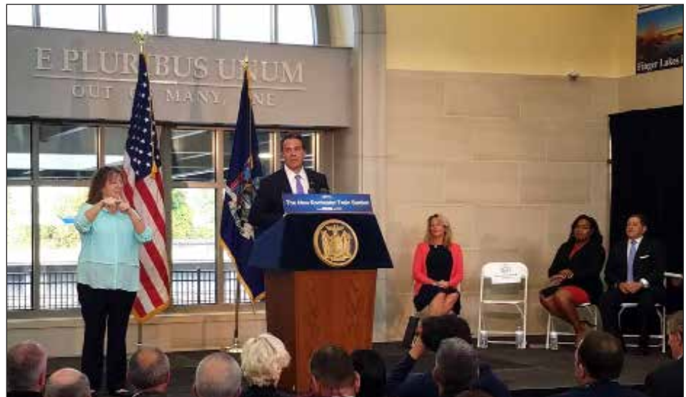
New York Gov. Andrew Cuomo joined local politicians for the dedication of the new Amtrak station in downtown Rochester on October 6. The first trains to use the new station were the eastbound and westbound Maple Leaf trains (New York-Toronto) that arrived nearly at the same time. The new station is served by two tracks surrounding a new island platform.