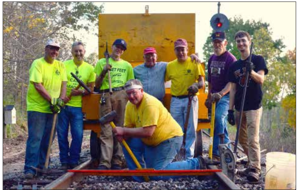
RIGHT: The Tuesday Night Track Gang celebrated the replacement of their 51st tie of the 2017 season on October 10. This number also includes assisting with the installation of more than 25 ties on the mainline north of MP Point-Four over the summer.