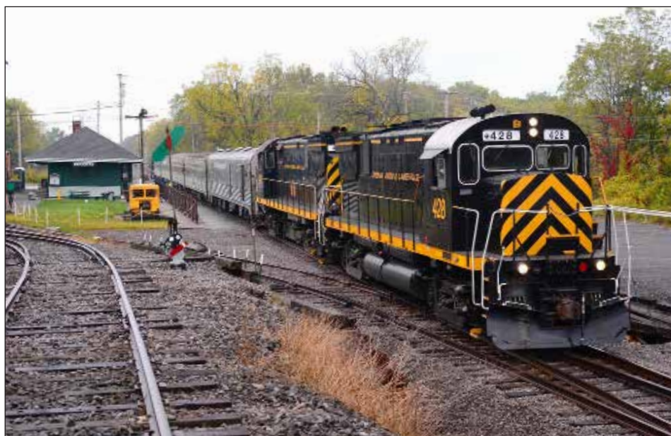
The 2017 Fall Foliage Express pauses at Industry Depot on October 7 to change ends for the return trip to Lakeville. Despite the gray, wet weather, all trains were sold out.

Our next meetings will be December 21, 2017 , and January 18, 2018 , programs to be announced. These events are FREE to attend, so bring a friend! Please contact me with your suggestions for future programs