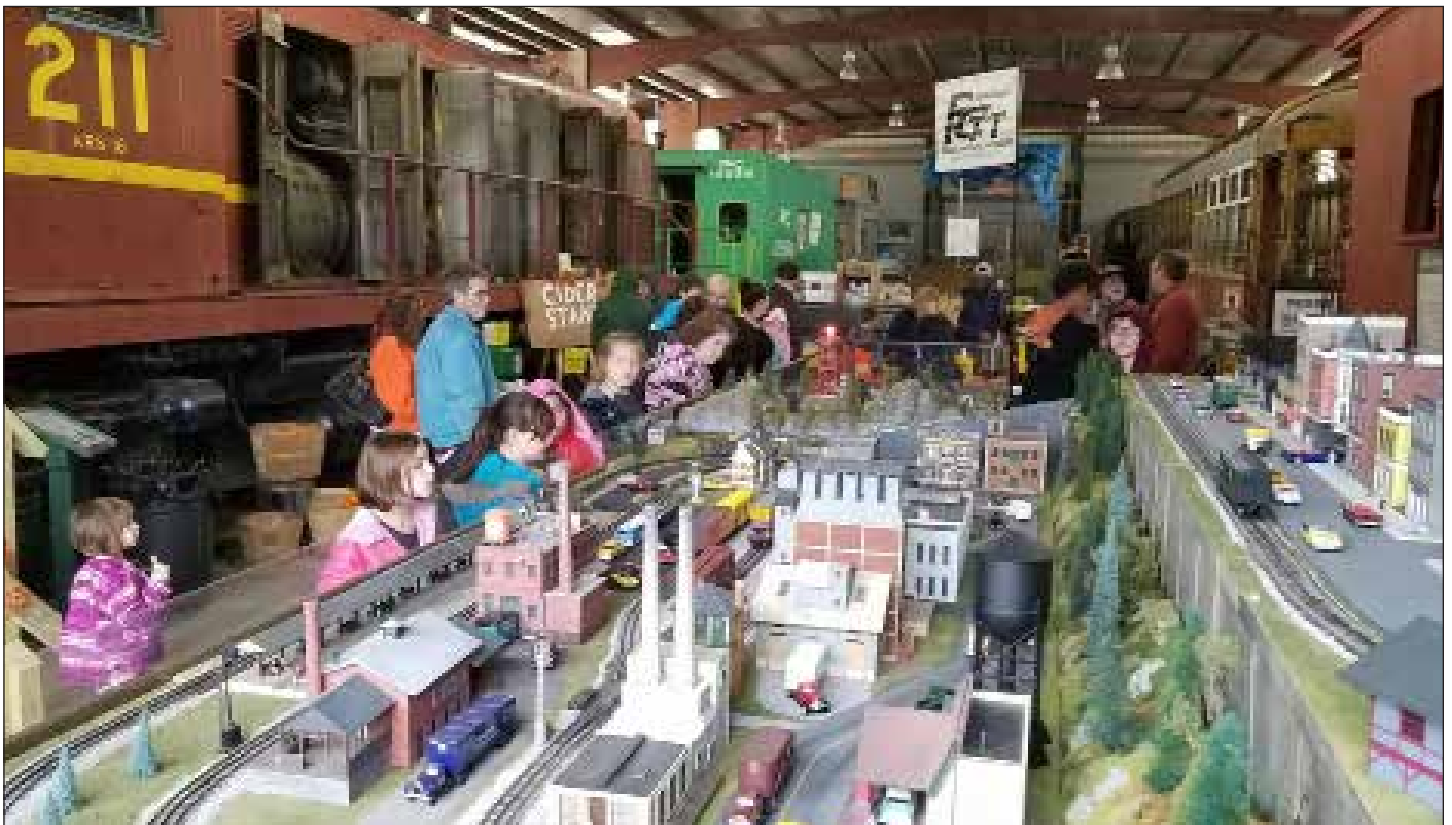
The FCTT HiRailers exhibited two O-scale model railroad displays to entertain our visitors in the Restoration Shop during our three weekends of Pumpkin Patch Train Rides. Everyone enjoyed the additional entertainment and we look forward to welcoming the club back again next year!

Find us on Facebook! facebook.com/rgvrrm