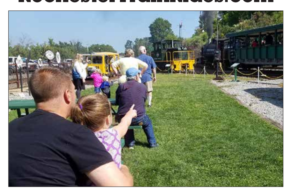
Viscose 6 put on quite a show each time it departed Industry with a train. The depot lawn provided an excellent viewing area to take in all the action throughout the event.