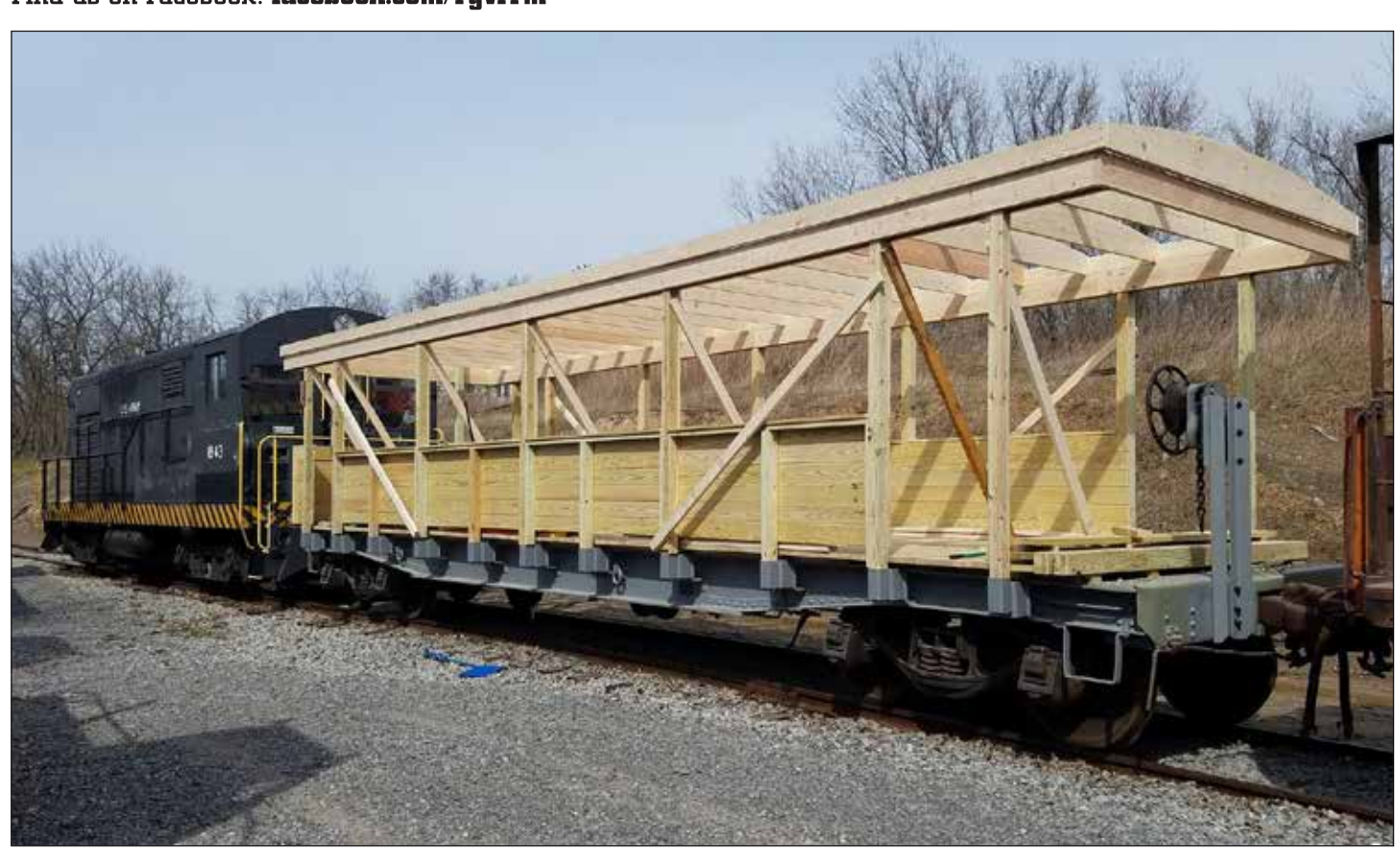
FIRST LOOK AT THE SUN: The open-air flatcar project gets its first look at the sun during some switching moves made on April 9. Built on an old 40-foot Army flatcar acquired from the Lowville & Beaver River Railroad, this open air car will be carrying visitors on our museum railroad this summer.