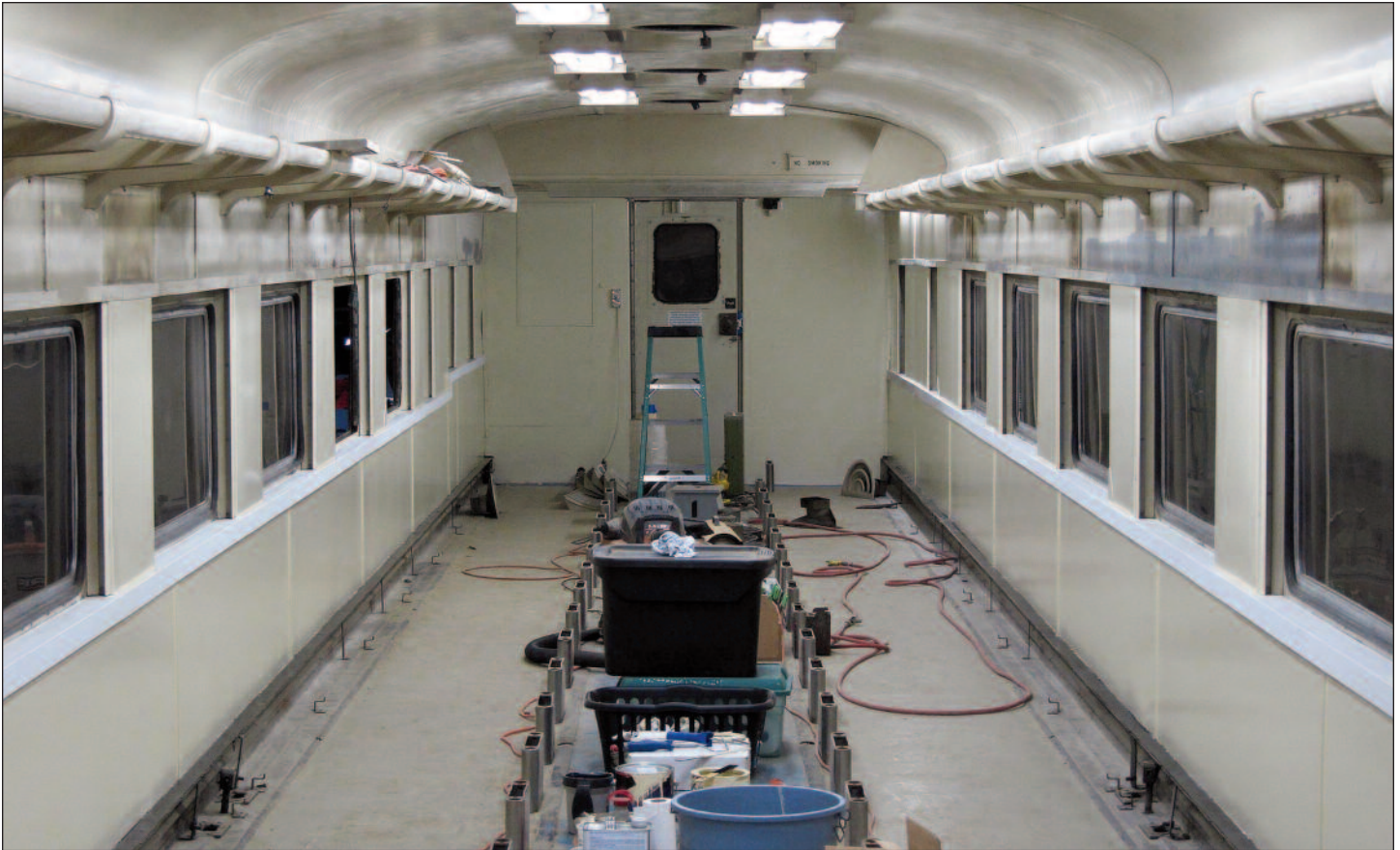
Interior finish painting continues inside NYC coach 2567.

ing, and generally improving that particular end of our hundred-year-old depot. The Southern most portions of the East as well as West end walls have been included in the very dedicated effort. The trio has now turned their attention to the back to Empire State Express coach restoration. There is panel replacement, window work, in addition to a host of other activities to be done. They need you to help, if even for one session on a Saturday or Tuesday.