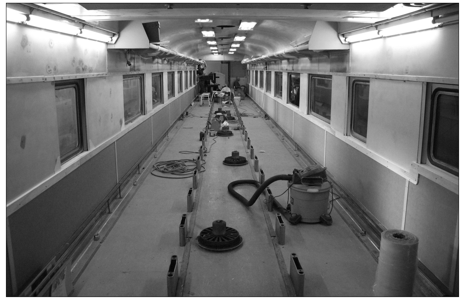
PROGRESS... AND ALMOST READY FOR PAINT! The interior of former New York Central "Empire State Express" coach #2567 grows ever closer to seeing finish painting and the end of its interior restoration. The new lower walls have been completed and most of the interior has been sanded. A little more sanding and then the car will receive its new interior paint. The end is drawing near, but there is still a lot of work to do to complete the job and get our coaches "back on track." Can you help us?