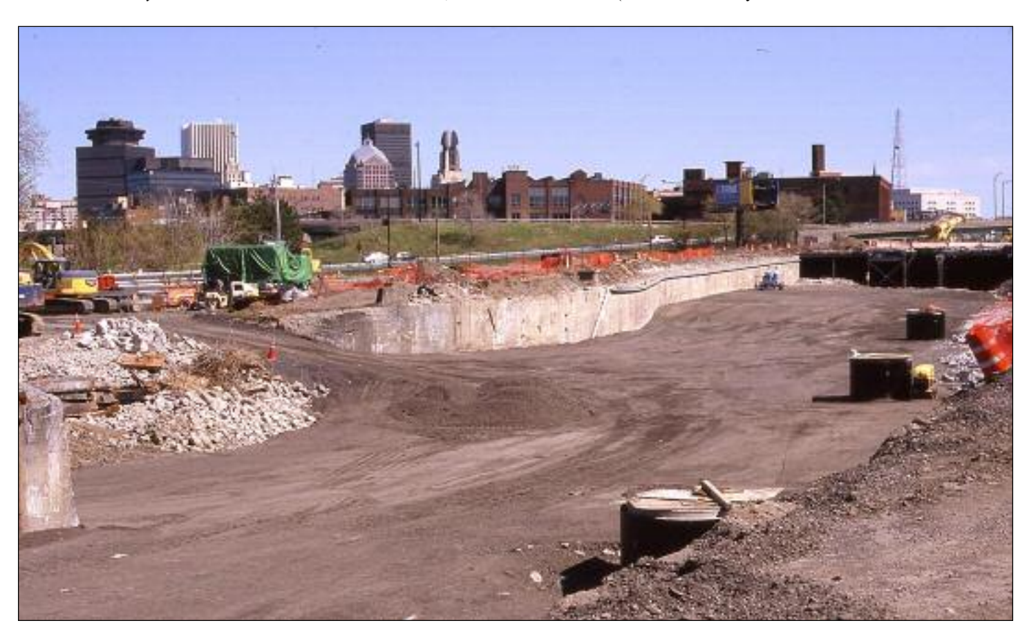
COMING OR GOING? Going, unfortunately. In this mid-April view, crews were busy compacting layers of fill to raise the level up to the old surface of Broad Street. A temporary construction ramp has been created in what was the Oak Street Loop, where local cars from Rowlands and interurbans from Syracuse would turn back. The distant steel X-braced structure is a remnant of the ramp that once allowed Subway-surface access for streetcars. The old BR&P/B&O freight interchange ramp was located at the far right of this photo. Volunteers from NYMT were able to salvage some track materials from the ramp for future use.

Unfortunately, it appears that Rochester has lost a valuable transportation asset in the short-term. However, as talk turns to "smart" downtown development and rebuilding, rail might play a role in the future of the Flower City, most likely on new surface routes and without the Subway. —Otto M. Vondrak