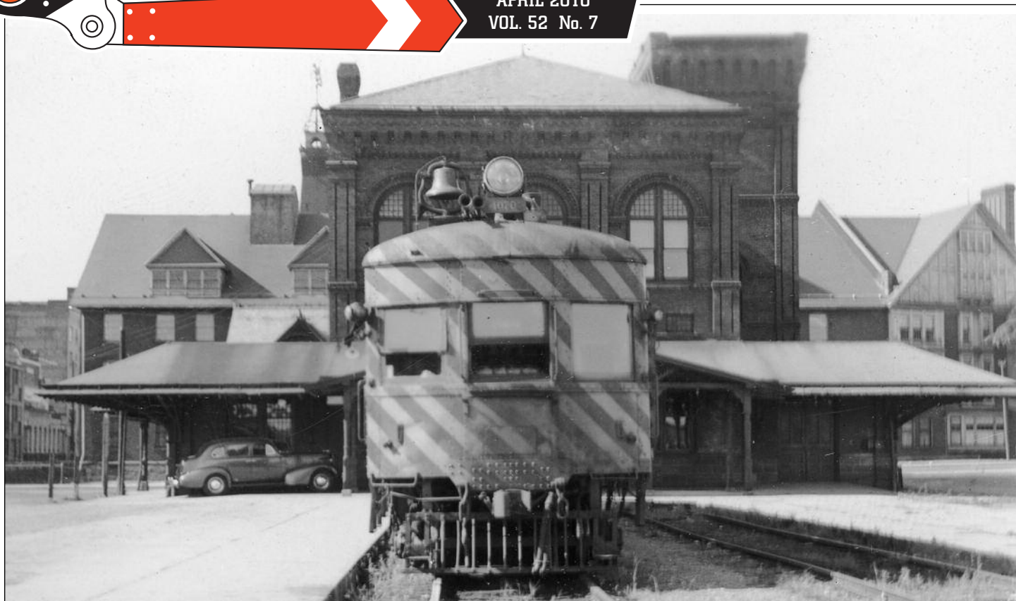
AN "ERIE" EXPERIENCE: Gas-electric motor car 4070 prepares to depart the Erie Station on Court Street in August 1941, near the end of regular passenger service on the branch. See page 6 for more details!