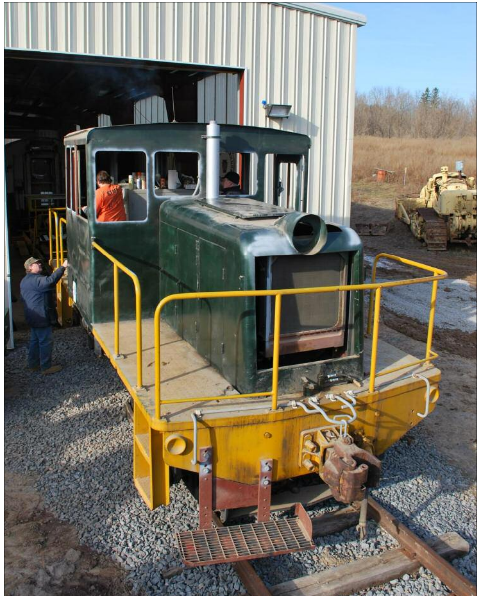
ALL FIRED UP! Rochester Gas & Electric emerged from the Restoration Building under its own power on Saturday, March 27.

We've decided to move our motive power meetings back to the original day and time of the month. Starting in May, the motive power meetings will take place at 9:30am on the first Saturday of every