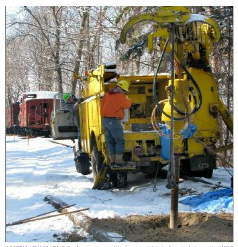
SETTING NEW POLES: Following on a successful extension of their trolley wire last year, the NYMT with assistance from R&GVRRM volunteers and equipment took the next and biggest step, planting the poles to extend their trolley wire to the end of the NYMT property at approximately milepost 0.5. Here we see R&GVRRM volunteers, Scott Gleason and Dan Waterstraat, working the R&GVRRM's auger truck to set the second to last pole. The R&GVRRM's railroad equipment stored on the mainline can be seen in the background.

The Unknowns: At this writing there are several unknowns. Parts have been ordered to repair TC-1. When they arrive we can only hope that they fit and it can be returned to service. It is uncertain where the track cars will be stored. It is also uncertain how we will handle placing a second track car in service when only one is being used. These details will be worked