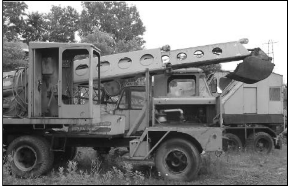
The chapter's newly acquired Gradall truck mounted ditcher. This excavator will be ideal to digging the locomotive inspection pit in the building. (Photo & caption by Joe Scanlon)

Martisco NYC Station Museum, 2 miles south of Camillus, NY, of NY 174. Open Sundays, 2-5PM. Restored Auburn RR station, next to Finger Lakes Railway. 315-488-8208. ( American Rail Links , # 170)