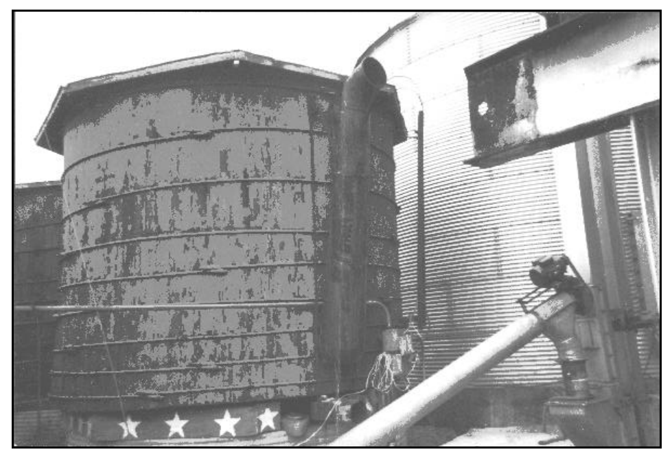
This is one of three former railroad water tanks that are now used for storing grain. Story on Page 5. Note the water spout!