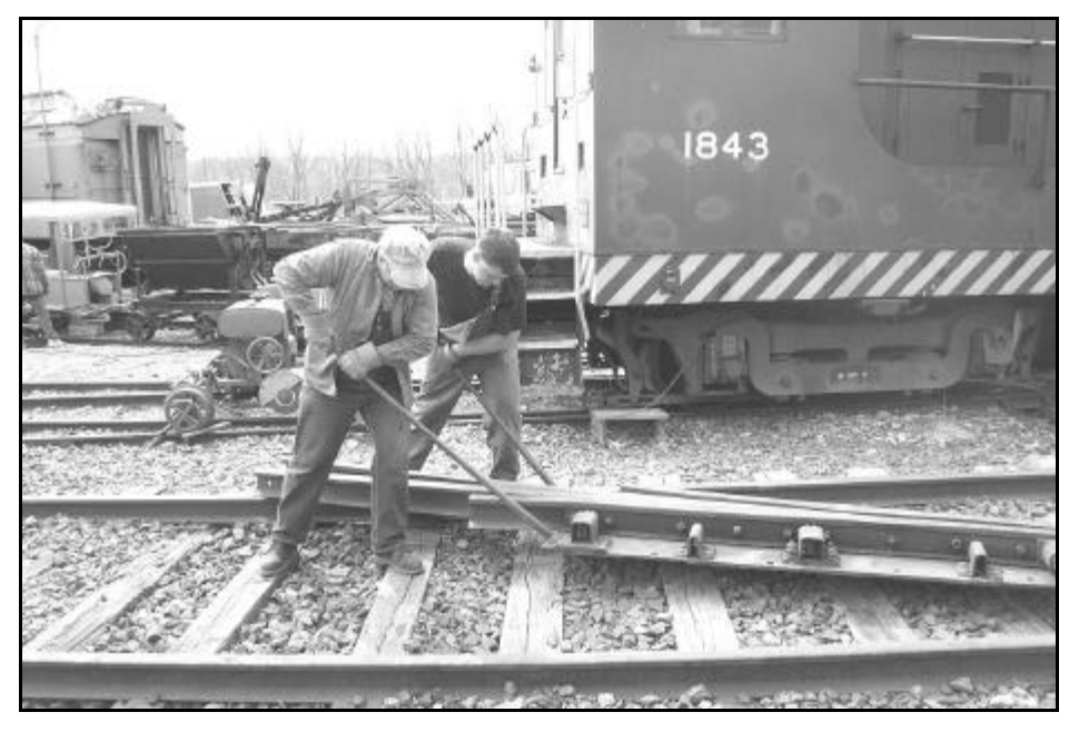
Randy Bogucki and Tony Mittiga put their shoulders into moving the rebuilt frog for Switch 5 into place the old fashioned way with lining bars.

and rehab to protect integrity of track car and train operations.