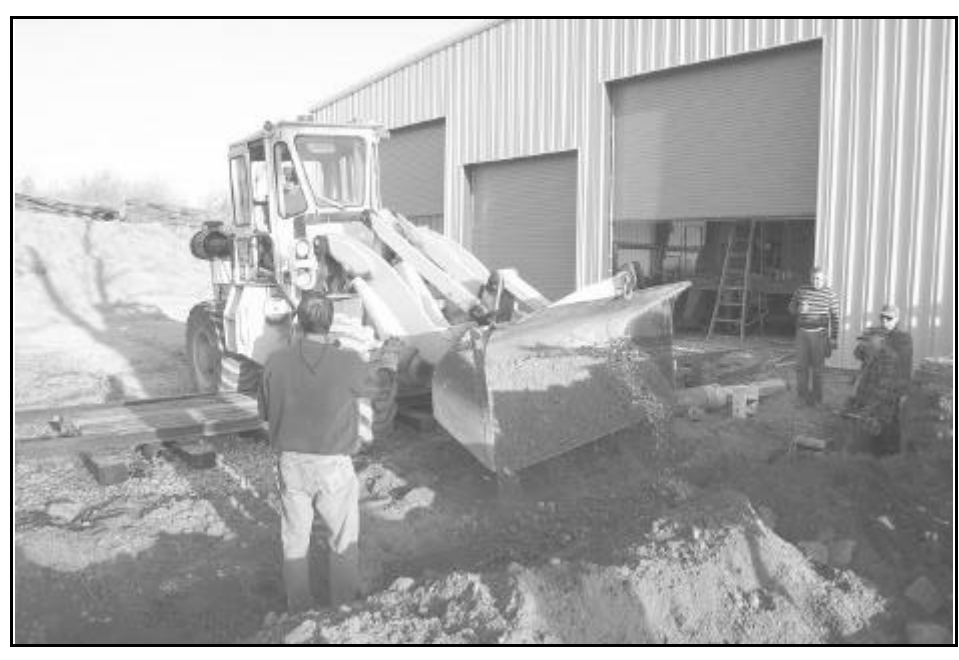
Dan Waterstraat commands the Trojan loader under the direction of Scott Gleason as they backfill a ditch created after some of the buried conduit on the north end of the building was modified to meet the current restoration building plan.

http://www.rochnrhs.org/ for the latest up-to-date news and events.