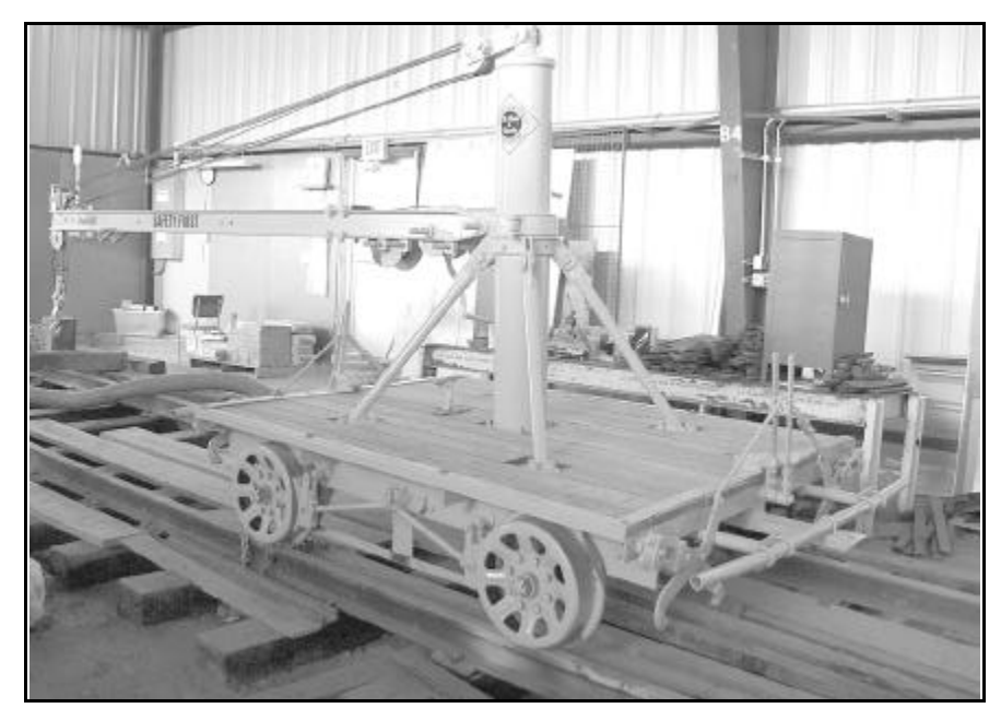
The Museum's Fairmont track crane, after some heavy steel work, sports a new wood deck and yellow paint. Note the addition of lettering and R&GVRR Museum logos.