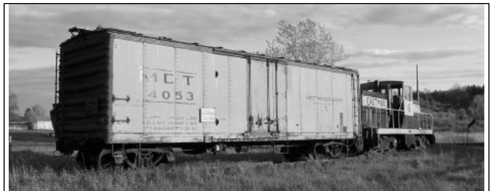
EK6 and one of our two MDT refrigerator cars exit the back side of the NYMT loop on the way to the Industry yard setup for display for our visitors.