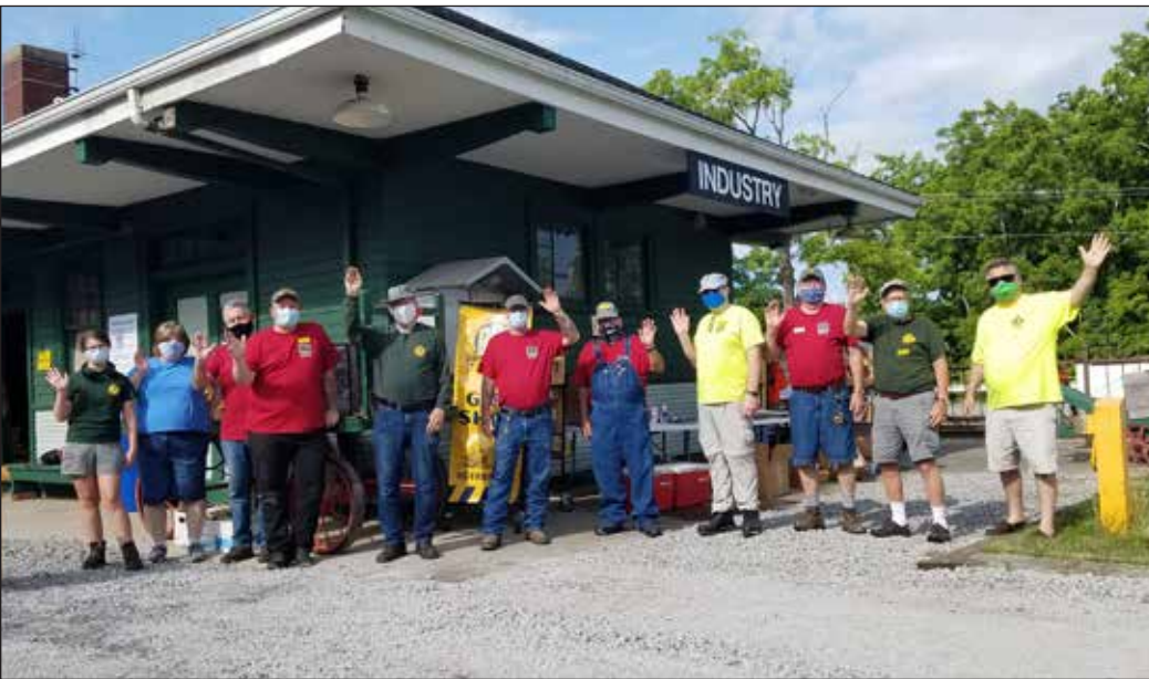
LEFT: Museum volunteers welcomed the public to tour the museum grounds and a train of cabooses during our “Five Dollar Day” Open House on July 25. This event helped us test our new COVID-19 safety protocols.