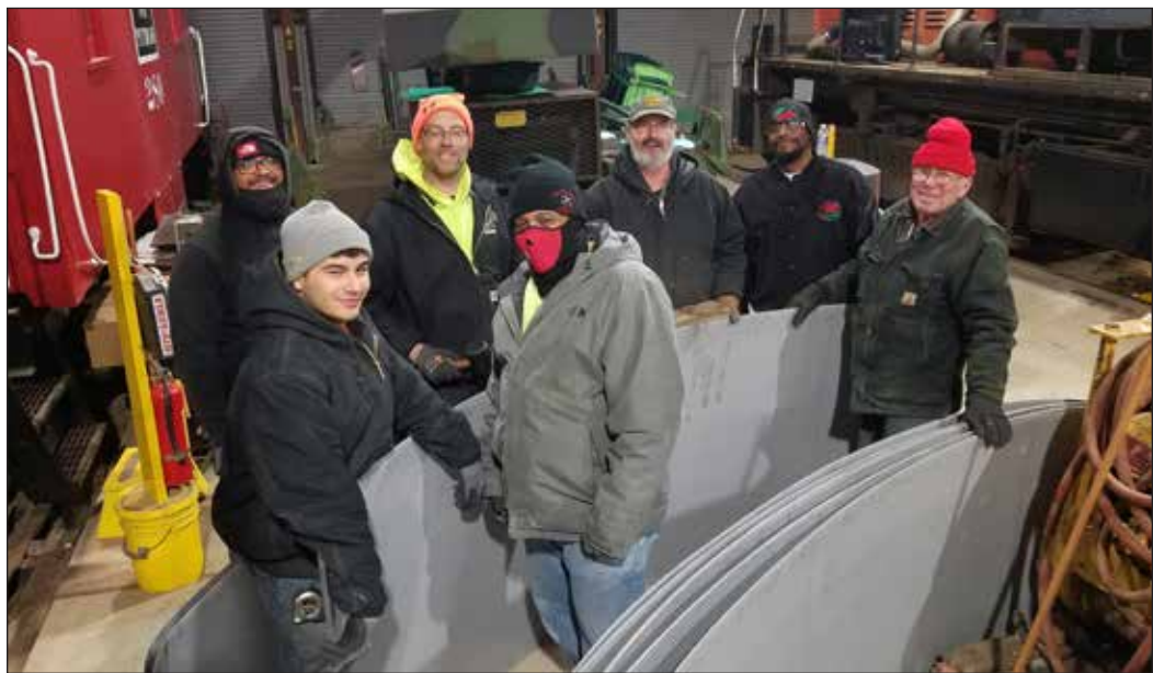
ABOVE: Sheet Metal Workers Union Local 46 apprentice program arrived on January 20 to help install the new sheet metal roof on Rochester Subway Car 60.