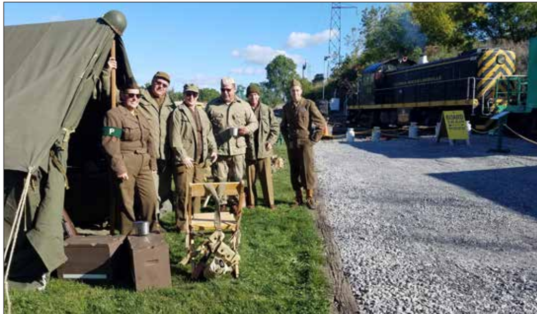
ABOVE: On September 19 and 20, we hosted Salute to Veterans Train Rides, in cooperation with Black Lions 2-28 Vietnam Living History Group. They set up encampments at Industry and in the Upper Yard.