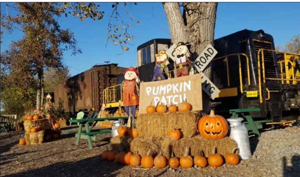
BELOW: The museum hosted three weekends of Pumpkin Patch Train Rides. Even at reduced capacity, the revenue generated was enough to pay our operating expenses for the year.