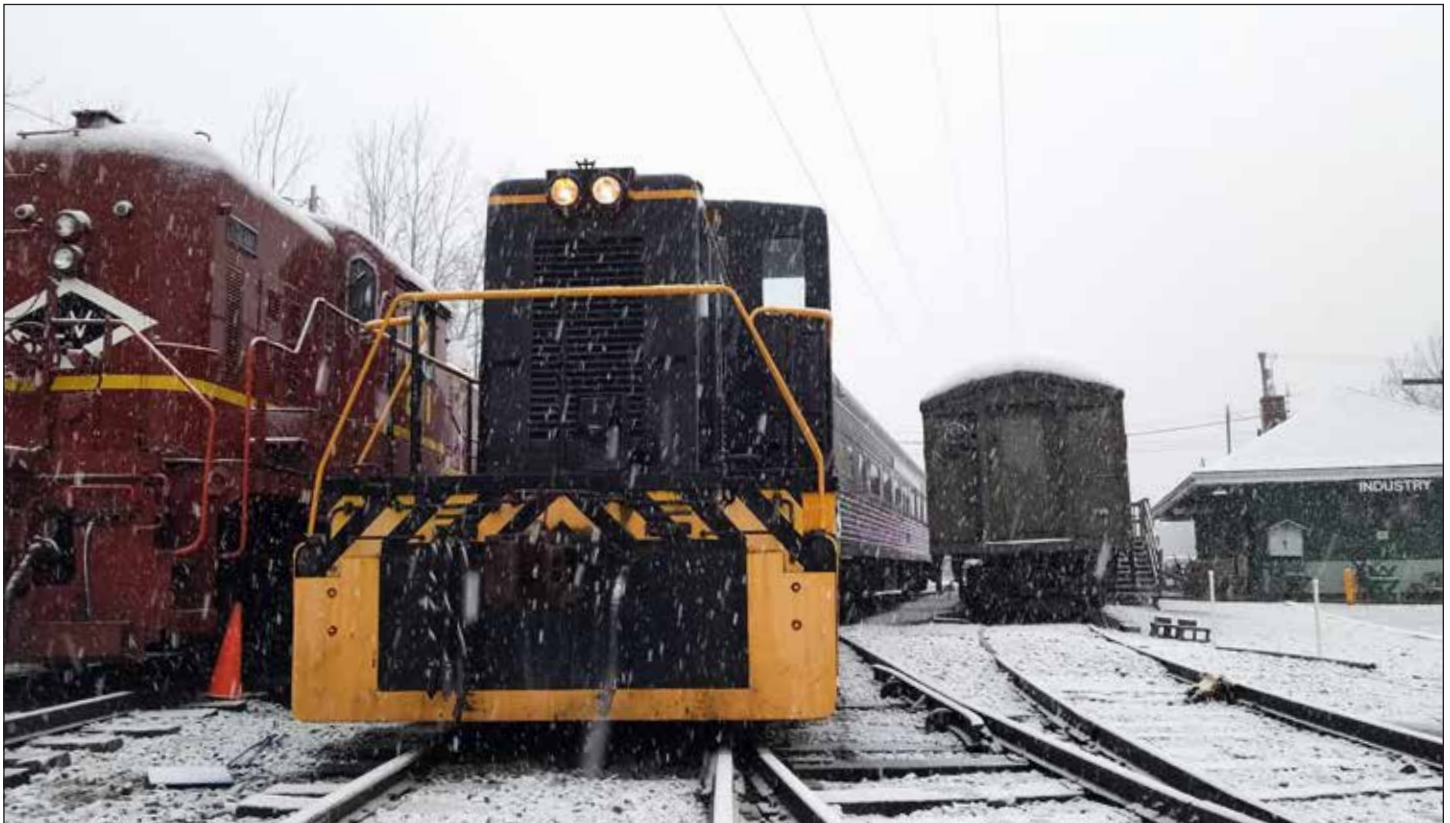
The weather has just changed over from rain to slushy snow, quickly coating everything in sight. The 4:00 departure of the Santa Train to the North Pole is just getting ready to depart with another train sold out to capacity on December 14, 2019. See page 4 for details.

Find us on Facebook! facebook.com/rgvrrm