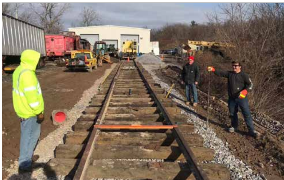
TOP AND ABOVE: Volunteers completed spiking and gauging on the Track 9 South Extension behind the shop by the end of November. Some additional work will be required in the coming months before this track can be used for active storage capacity.

Shannon will discuss the role photography played in the race to lay tracks across North America in the 1860s.