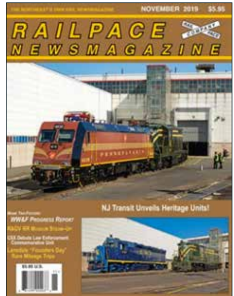
STEAMY SUBJECT: November 2019 edition of Railpace has a great feature story about our steam operation with Viscose 6.

FOR THE LATEST NEWS AND PHOTOS, VISIT US ONLINE AT: FACEBOOK.COM/RGVRM FLICKR.COM/RGVRM