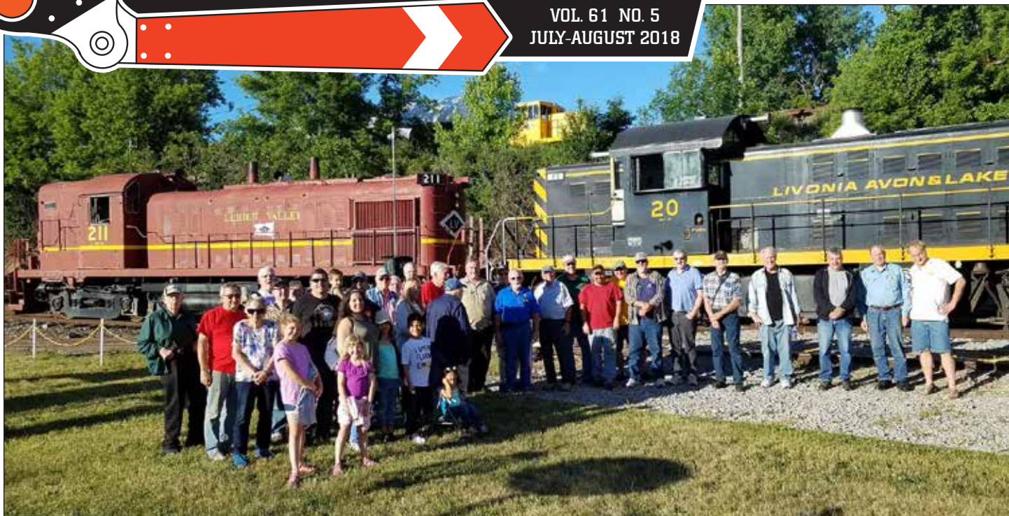
Your museum operated a rare double-header for our June 21 museum member meeting, including Lehigh Valley Alco RS3m no. 211 and former Livonia, Avon & Lakeville Alco RS-1 no. 20. Monthly museum meetings will return to the 40&8 Club beginning in September.

NEXT MEETING: August 16 MEETINGS MOVE TO INDUSTRY DEPOT Enjoy Train Rides!