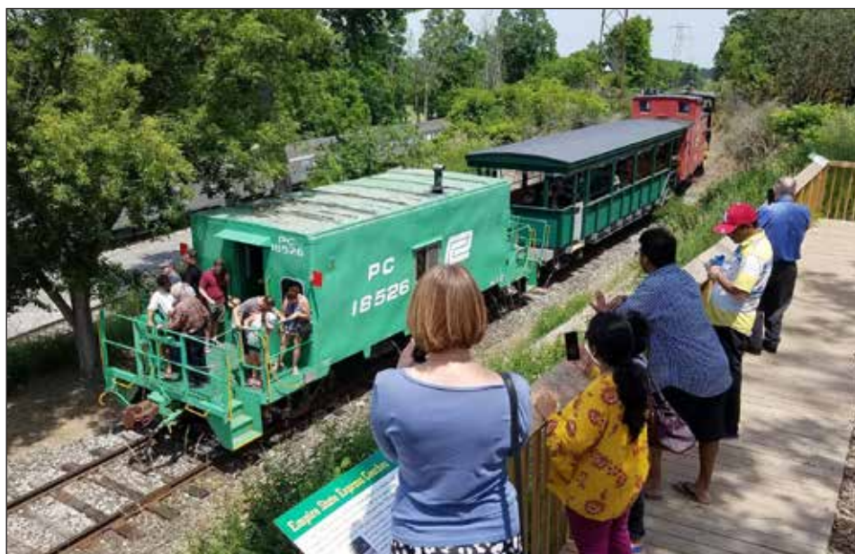
The Railfan Overlook has become a popular addition to our museum experience. The best views are during the morning hours as our trains climb and descend the Hill Block.