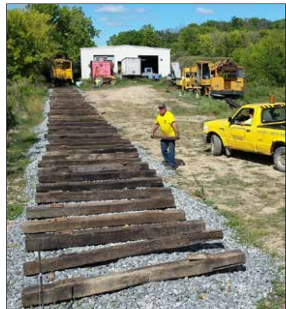
ABOVE: Volunteers placed ties for the extension of Track 6 behind the Restoration Shop on September 24. ABOVE RIGHT: By early afternoon, all ties had been placed on the 300' extension. RIGHT: Volunteers returned the next day to place rail, with the assistance of our ex-Army Skytrak Telehandler forklift. BELOW RIGHT: A coat of rusty metal primer was applied to the west side of Pennsylvania Railroad Railway Post Office No. 61950 in September.