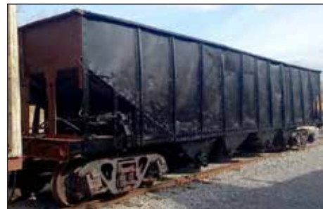
THE GREAT PAINT PROJECT: Two of our steel freight cars got a fresh coat of paint to help stabilize the structure and improve their appearance. MDT refrigerator car No. 12549 was built in 1953 and acquired in 1997, while PRR hopper car No. 747803 was built in 1909 and acquired in 1998. The majority of work was performed over four weekends. The cars will be returned to Track 6 by the end of the month. While this was not a restoration project, lettering may be applied to these cars in the future to further enhance their appearance. Thanks to all the volunteers who helped check this off the list!