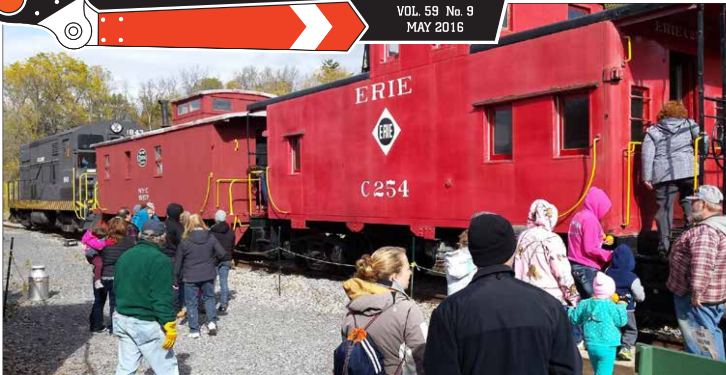
Visitors board cabooses in the Upper Yard, preparing for the return trip to Industry. Three cabooses are now available for regular service, including New York Central 19877, Erie C254, and Penn Central 18526. Our opening weekend is June 18-19. See page 2 for full 2016 schedule of events.

NEXT MEETING: May 19 INDUSTRY DEPOT: Enjoy a train ride on your museum railroad