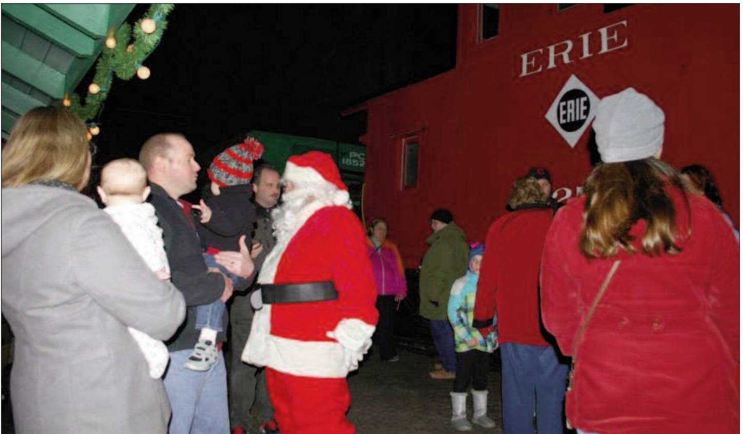
Santa Claus greets visitors to the "North Pole" on the evening of December 6, 2014. Trains departed from Industry and traveled to the "North Pole" at Midway so that riders could visit with Santa Claus, get a candy cane, and enjoy a cup of hot chocolate before boarding for the "long trip" home. All trains were sold out, and we look forward to duplicating this event in the future.

— Like us on Facebook: facebook.com/rgvrrm —