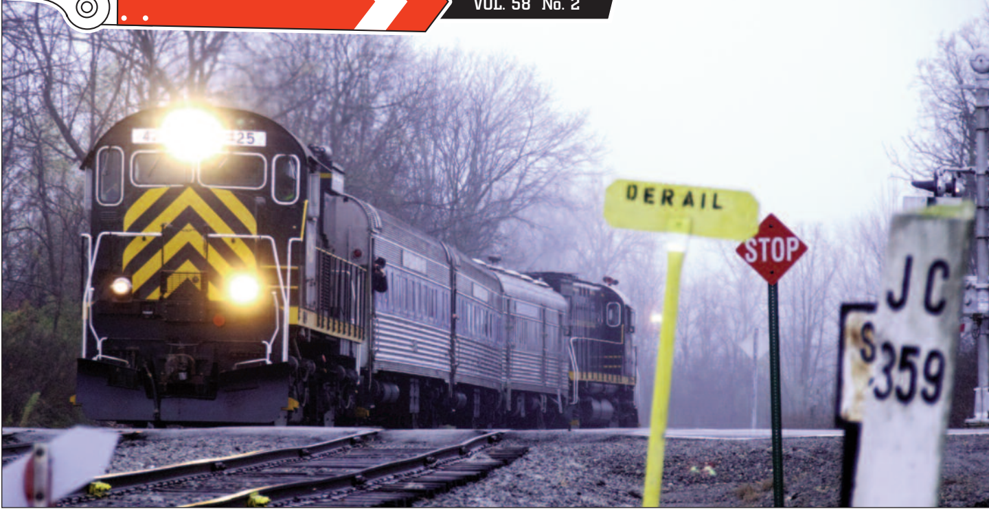
Dave Scheiderich caught our 2012 "Rare Mileage Excursion" at Conesus Lake Junction on October 27, 2012, which then consisted of two of our ex-NYC coaches and the RPO-turned-power-car. Our 2014 Fall Foliage Express trains will feature three coaches, and it is expected all four trains will be sold out to capacity. This year's run will be the first fall foliage excursions we have operated in nearly a decade.

NEXT MEETING: October 16 Jim Otto and Ken Freeman: "The Hojack in Hilton"