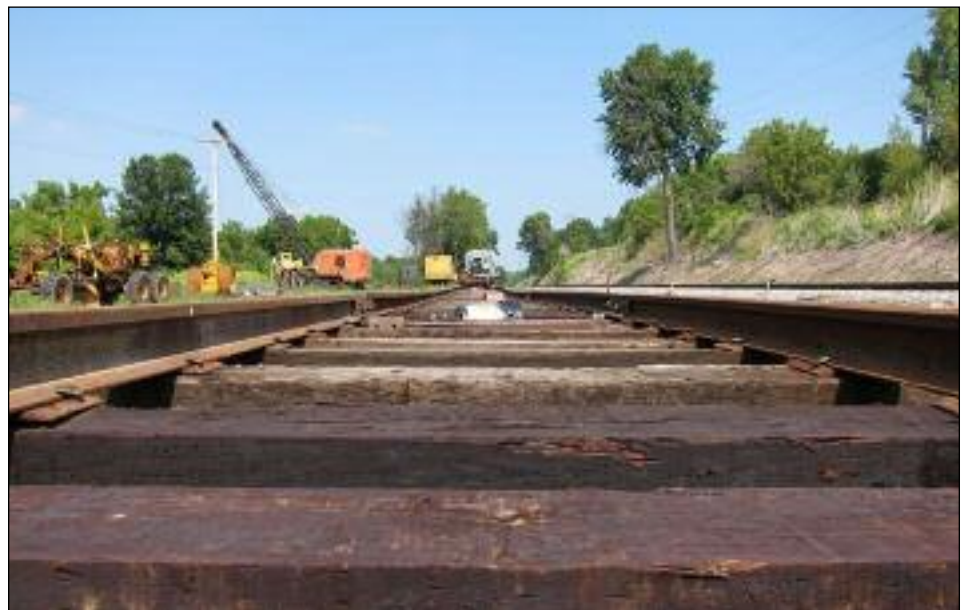
Spikes as far as the eyes can see on September 3! The extension to our passenger car siding has been completed. Now we need to get the ballast deliveries started, but we need your help. Please consider giving to our Donate-A-Ton fundraiser (Online at rgvrrm.org/support). A $20 donation buys a TON of stone and we need at least 150 tons! Please help us continue the progress!

Union Station Museum. We got to talking, and he mentioned that he had tried unsuccessfully to contact our museum, but was not successful. When I introduced myself and let him know where I was from, he immediately donated the sign along with