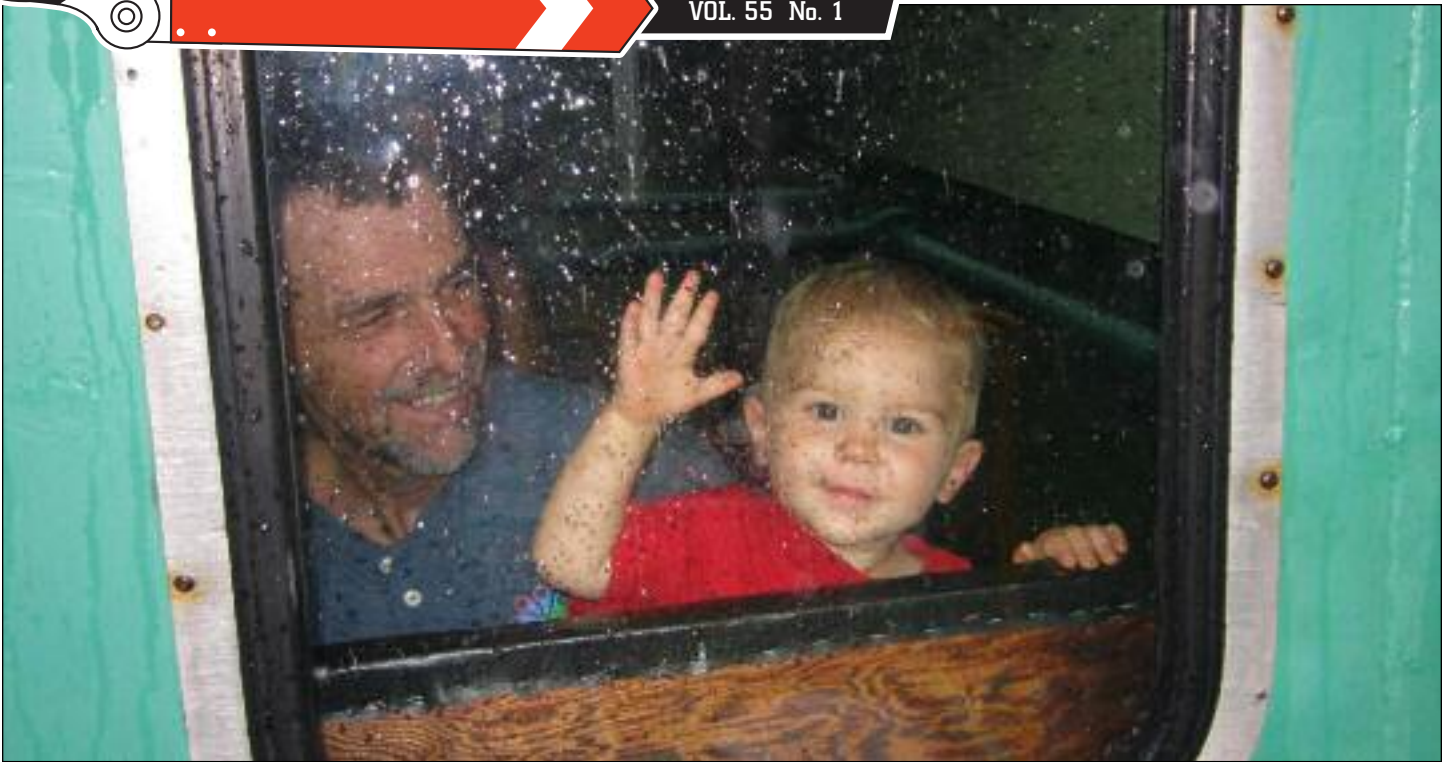
HERE'S WHY: The rain can't dampen the spirits of this young visitor and his father, riding in our restored Penn Central caboose during our annual Diesel Day event on August 21. Thanks to the many volunteers who made this event a success! Event coverage begins on page 4.

NEXT MEETING: September 15 Enjoy our museum railroad! Take a train ride! Bring a friend!