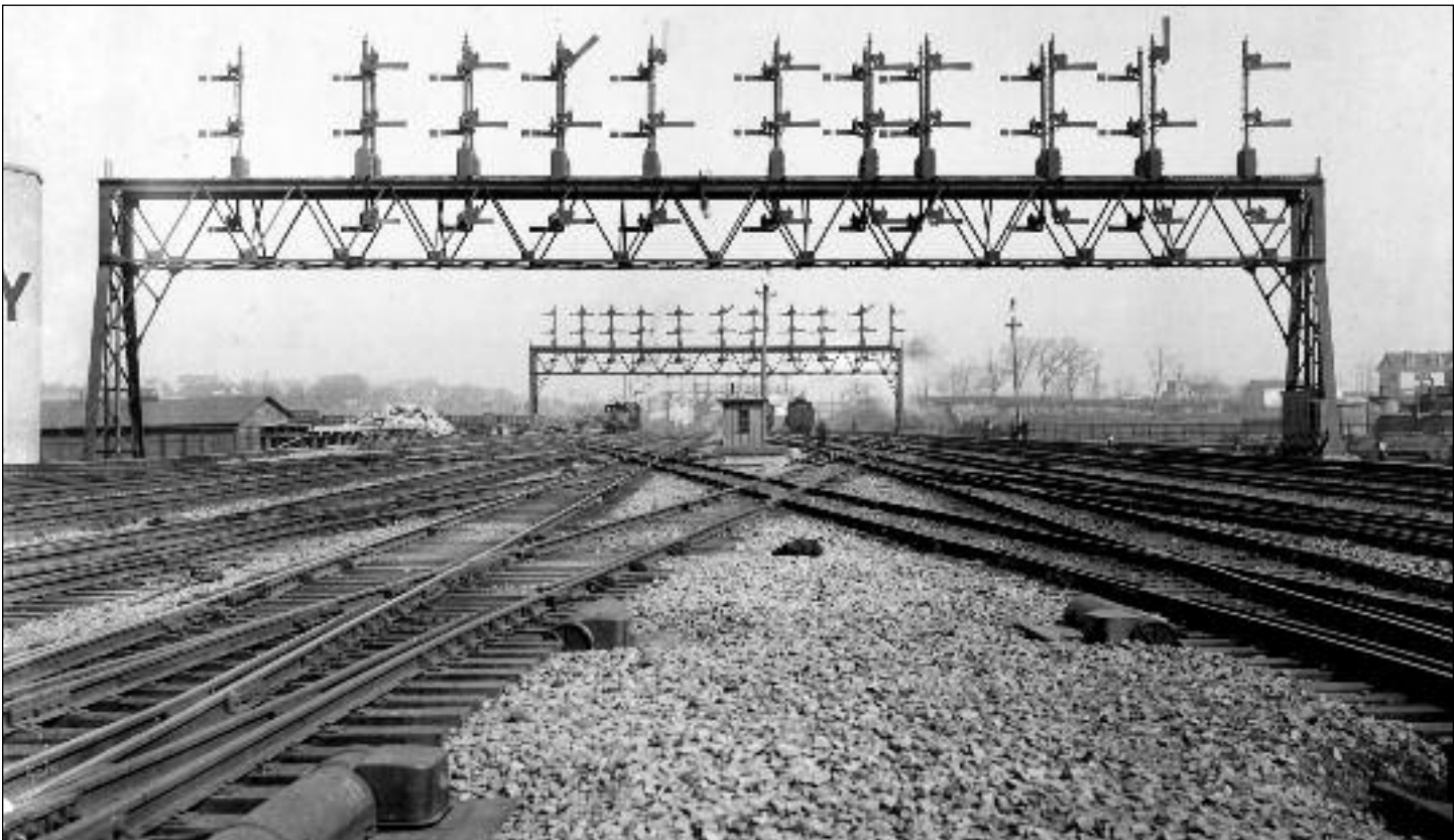
MYSTERY PHOTO: This vintage photograph showing a complex terminal approach guarded by semaphores has been hanging up in our depot's waiting room for many years, placed there by a volunteer long ago. Most likely this was a promotional photo from Rochester-based General Railway Signal. We're not certain of the location, though we think it is somewhere in the East. That's a SOCONY fuel storage tank at the left of the frame, and there is a Philadelphia & Reading switcher in this scene. Could it be Jersey City? Please contact us if you have an idea!

HEY! Tell your friends that the September meeting will be at Industry Depot!