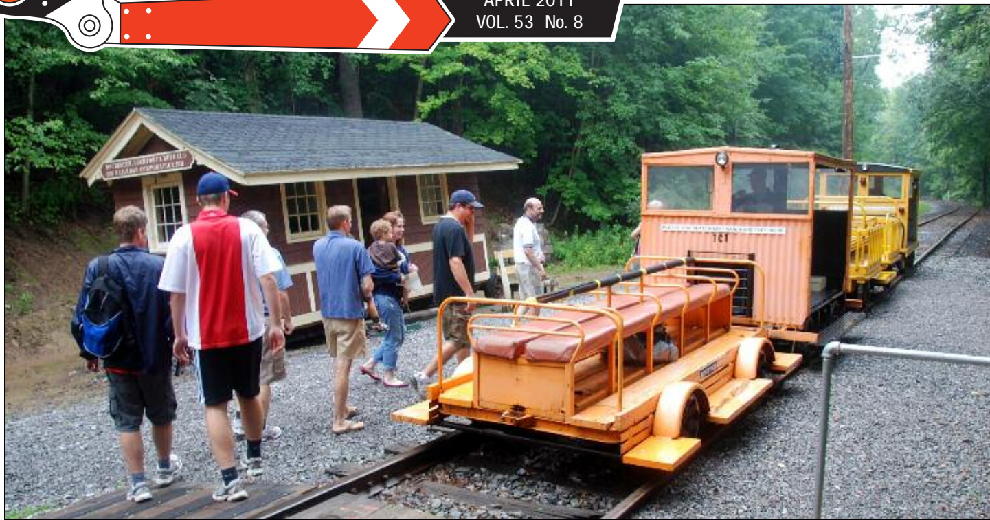
Track cars, diesels, and trolleys all share our demonstration railroad between Industry, Midway and our neighbors to the north at NYMT. Close cooperation and rigorous training allows continued safe operation, such as this 2009 scene at Midway as visitors make their way from NYMT's trolley to our fleet of track cars. Here's looking forward to another year of record-breaking attendance!