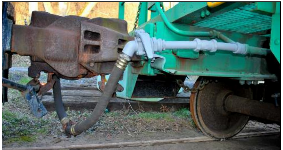
THEMS THE BRAKES: The cleaned up brake pipe (TOP) under the Penn Central caboose. A small portion of the pipe was removed, as the end was in rough condition. Rebuilt angle cock installed (MIDDLE) with new compression fitting. With a new air hose installed, the primed angle cock and brake pipe ready for paint (ABOVE).