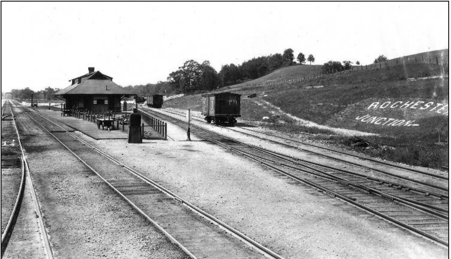
Rochester Junction on the Lehigh Valley railroad as seen at the turn of the century. We are looking west towards Buffalo, with the Rochester Branch peeling off to the right. This depot would be later replaced with a larger two-story structure, complete with canopies over the platforms. Notice the "ROCHESTER JUNCTION" spelled out in rocks in a garden across from the depot. See page 2 for a view of this area from 1971.